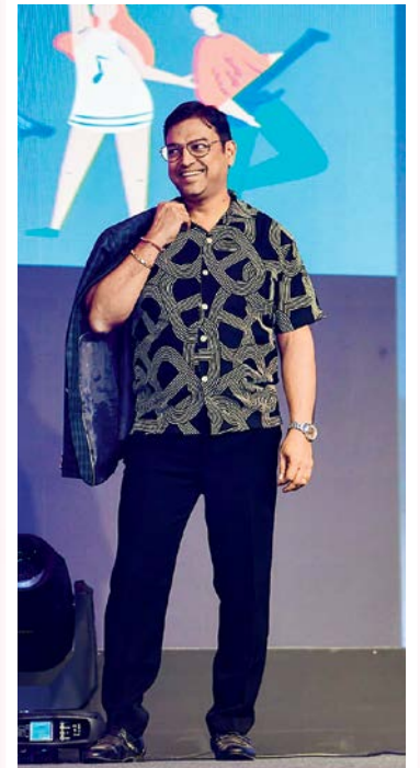
STYLE IN EVERY STRIDE: Work hard, play harder, and never go out of style. Trading the boardroom for the spotlight and bringing that unstoppable energy to the stage.