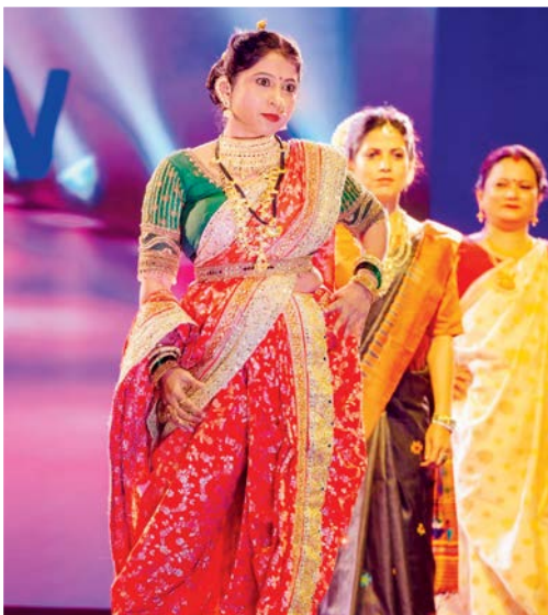
REGAL GRACE: A stunning blend of tradition and elegance, walking the runway with timeless poise and pride.