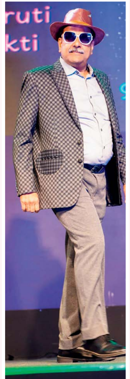
CLASSIC SWAGGER : Stepping in with timeless charm and effortless confidence, redefining style with every stride.