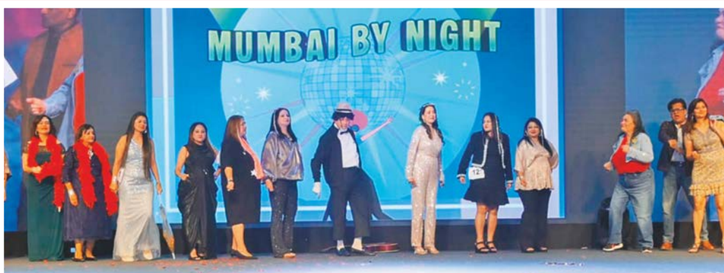
SPOTLIGHT STATE OF MIND Owning the stage where heritage meets the hustle. Bringing that unstoppable energy from the boardroom to the spotlight.