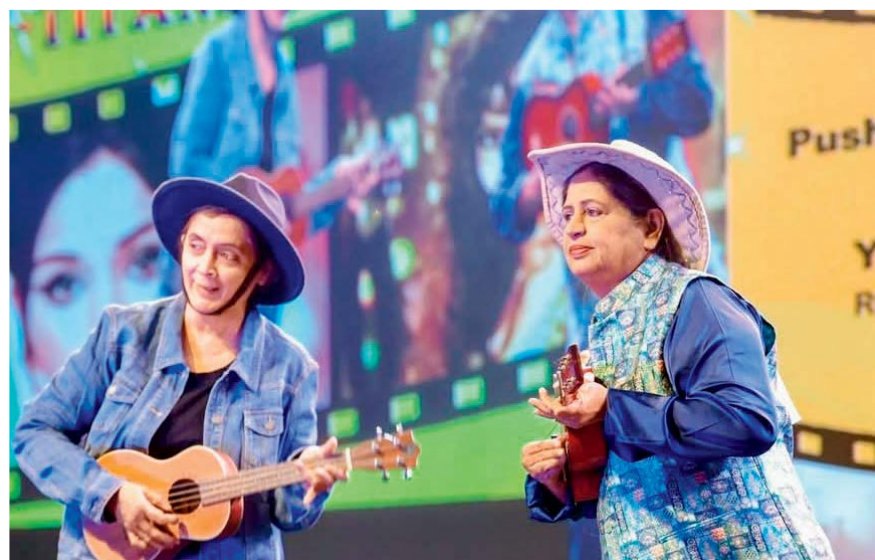
RETRO VIBES: Strumming nostalgia and charm, bringing timeless melodies alive on the runway.