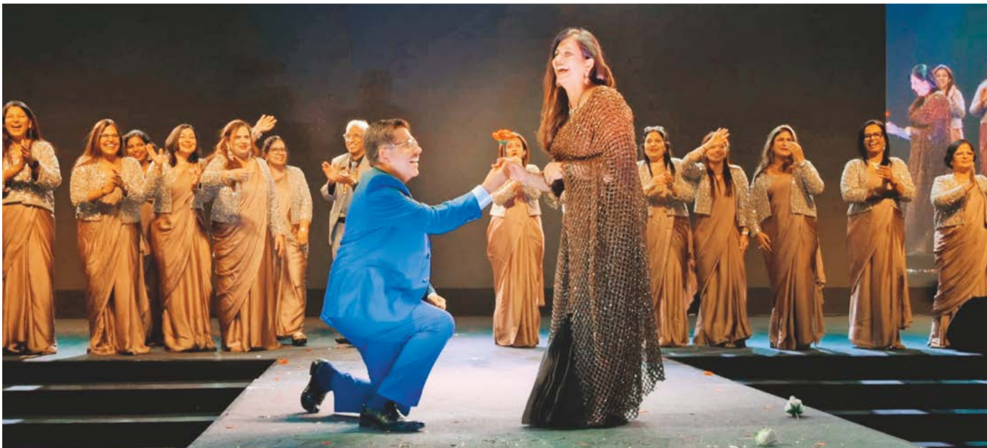
A MOMENT TO REMEMBER : A heartfelt surprise on the runway turns into pure magic, blending love, joy, and unforgettable celebration.