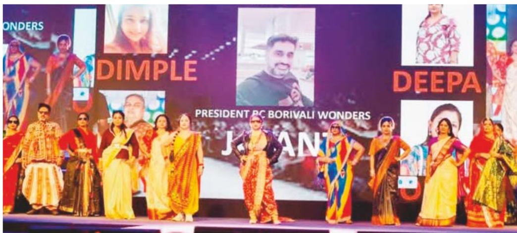
TRADITION REIMAGINED : Work hard, play harder, and never go out of style. Trading the boardroom for the spotlight and bringing that unstoppable, high-octane energy to the stage. Where heritage meets the hustle.