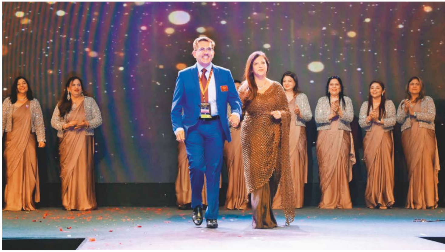
LEADING WITH ELEGANCE: Own the stage, own the moment. When the vision is clear, every step feels like a victory lap. Grateful for the journey and the incredible team behind us.

A vibrant runway celebration uniting diverse themes, cultures, creativity, and talented participants across all zones.