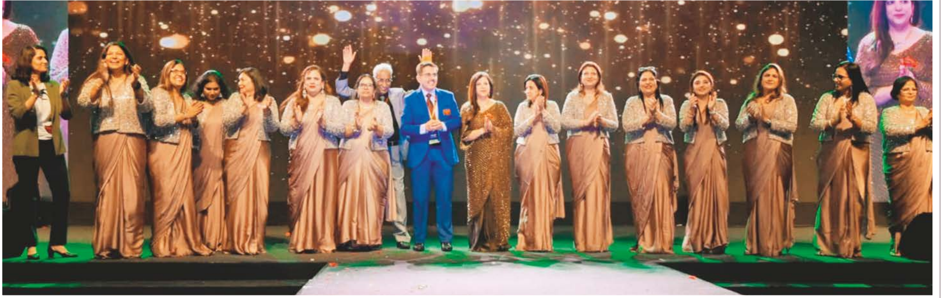
GLAMOUR UNLEASHED : A dazzling lineup takes the spotlight, celebrating elegance, unity, and the spirit of style on a radiant runway.

A vibrant runway celebration uniting diverse themes, cultures, creativity, and talented participants across all zones.