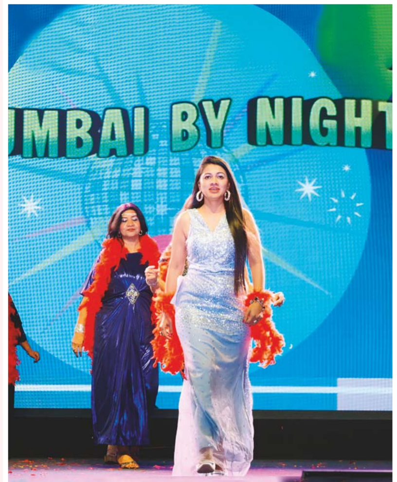
HERITAGE IN HIGH DEFINITION : From the boardroom to the spotlight, bringing unstoppable energy to the stage where heritage meets the hustle.