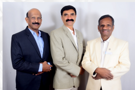
Editorial Team - Ekatha

Ekata is more than a magazine. It is a mirror reflecting your passion, your service, and your dedication. It is a space to share, to celebrate, and to be inspired. Every project report, every photo, every word you contribute adds strength to this platform of unity and purpose. Let us make this Rotary year not just memorable, but meaningful through collaboration, inclusion, and collective action. Let Ekata be the voice of our district's heartbeat—steady, strong, and full of service.