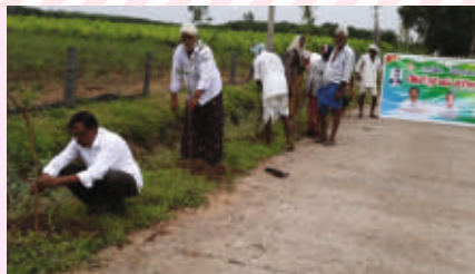
RC Pangur : 2000 Tree Plantation