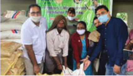
RC Smart Hyderabad : Mission Naagali - Fertilizers and Micro Nutrients Distribution