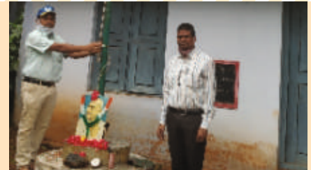
RC Kothagudem : Independence Day Celebrations