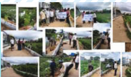
RC Cyberabad : Tree Plantation