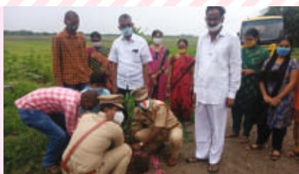
RC Pedanandipadu : Tree plantation