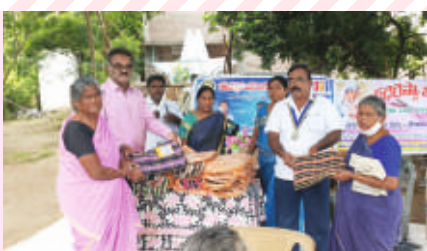
RC Singarakonda Addanki : Blankets Distribution to women at old age home