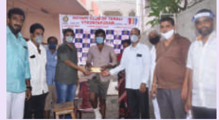
RC Tenali Vykuntapuram : Financial support to the disabled family