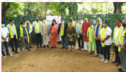
RC Sainikpuri Secunderabad : Tree plantation projects