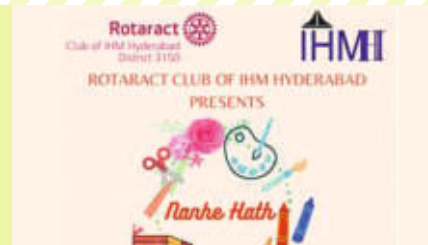
RC Hyderabad Central : Creative Craft workshop "Nanne Hath"