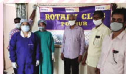
RC Ponnur : Reusable cloth Aprons Distribution to Hospital Staff