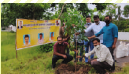
RC Guntur Centennial : Tree plantation