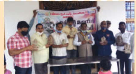
RC Manjeera Sangareddy : Distribution of Clay Ganesh