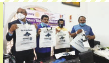
RC Hyderabad North : Say No to Plastic - Distributed 2000 cloth bags and Car stickers