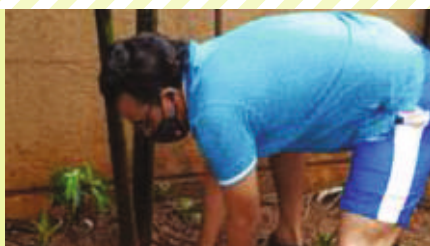
RC Hyderabad Deccan : 10500 Saplings plantation