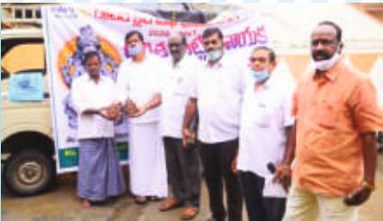
RC Bhuvanagiri : Rs.25000 worth of Clay Ganesha Distribution