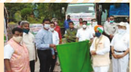
RC Nizamabad : A Mega Tree Plantation Drive - 25000 Saplings