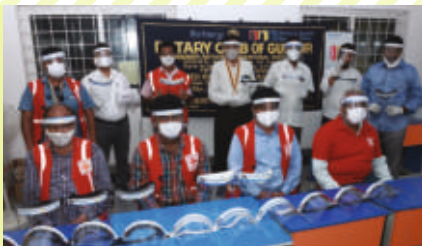
RC Guntur : Jai Ho - Police Dept and Red Cross