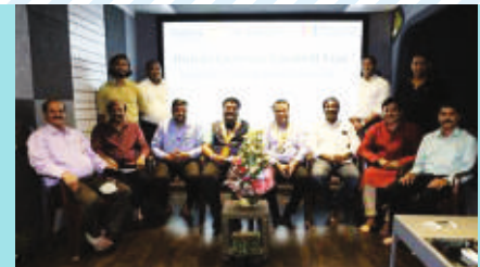
RC Bhagyanagar : District Governor Official Visit