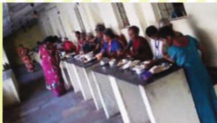
RC Hyderabad : Food Donation at Aaramghar Old Age Home