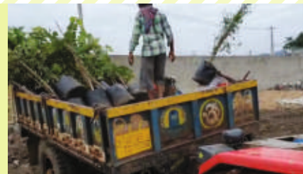
RC Guntur Aadarsh : Fruit plants distribution