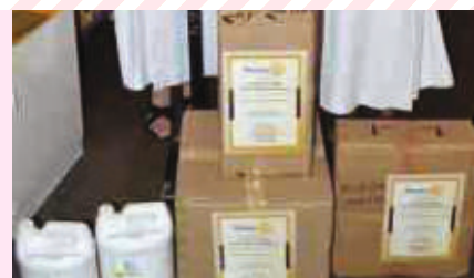
RC Secunderabad Sunrise : Covid Care for Elderly (Mega Project)