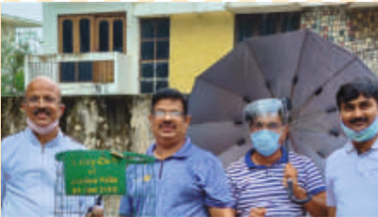
RC Jubilee Hills : Tree Plantation