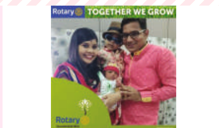
RC Secunderabad West : Tree Plantation