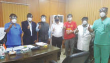
RC Hyderabad Pearls : Donation of Face shields to all Gandhi hospital doctors.