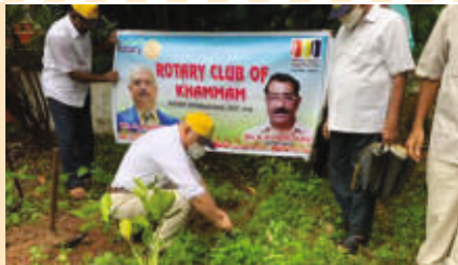
RC KHAMMAM : Tree Plantation