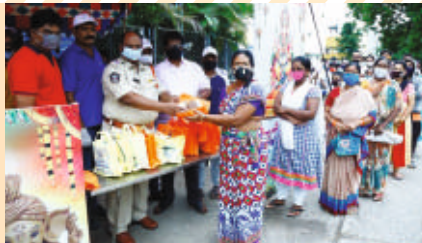
RC Mangalagiri : Free Distribution of Eco Friendly Ganesh Idols