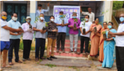
RC Macherla : Tree Plantation