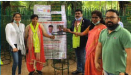
RC Banjara Hills Hyderabad : Plant a Tree