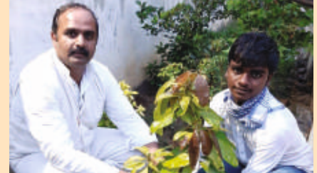
RC Inkollu Central : Plantation