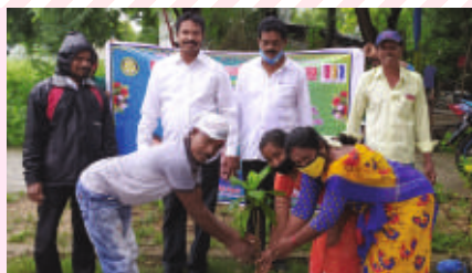
RC Sattenapalli : Independence Day Celebrations & Plantation