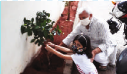
RC Secunderabad Cantonment : Biofence Plantation