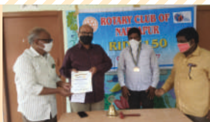
RC Narsapur : Club Installation