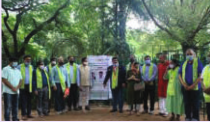
RC Spring Field Secunderabad : Tree Plantation