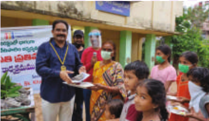
RC Vetapalem : Distribution of Clay Ganesha