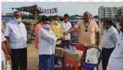
RC Pandaripuram : Distribution of Sanitizers and Covid-19 Masks