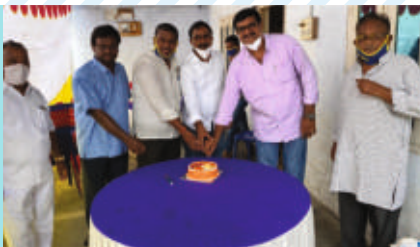
RC Chimakurthy : Friendship Day Celebrations