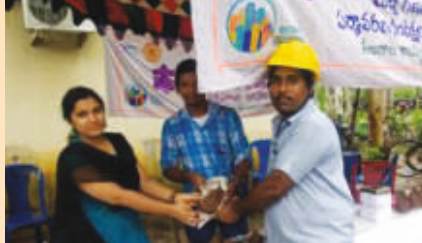
RC IN Bhadra Sarapaka : Meeting about clay idols distribution for vinayaka chavithi festival