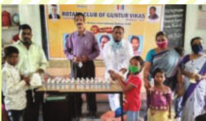
RC Guntur Vikas : Distribution of masks, sanitizers, etc., to students