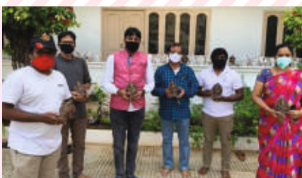
RC Secunderabad Spectrum : Clay Ganesha Distribution