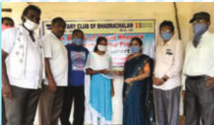
RC Bhadrachalam : Charity to Poor Tribal Girl