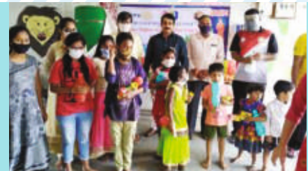
RC Chandanagar R.C. Puram : Awareness on Water, Sanitation & Hygiene