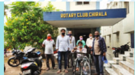
RC Chirala : Tricycles distribution