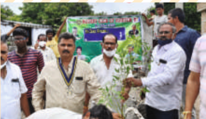
RC Martur : Tanguturi Birthday Celebrations