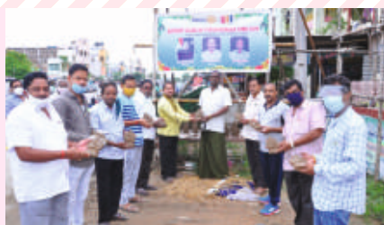
RC Piduguralla Lime City : Clay Ganesha Idols Distribution