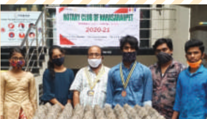
RC Narasaraopet : Clay Ganesh Distribution