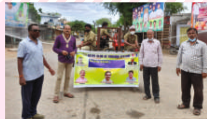
RC Parchur Central : Sanitization Programme