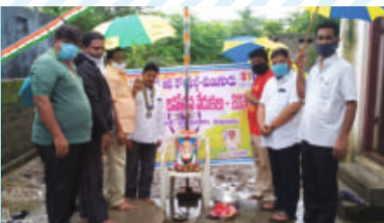
RC Coal Field Manuguru : Independence Day Celebration