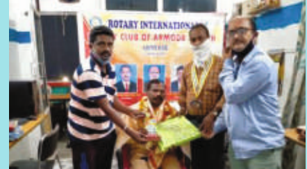
RC Armoor Aadarsh : Telugu Bhasha Dinotsavam