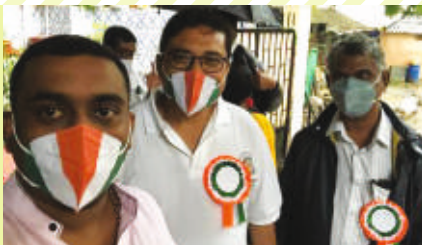
RC Hyderabad Centennial : Independence Day Celebration