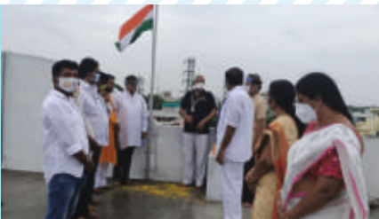
RC Chilakaluripet : Independence Day Celebrations