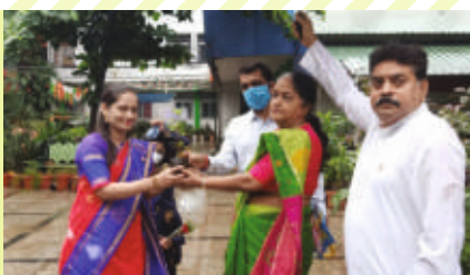
RC Hyderabad Mid Town : Tree plantation programme in Upkaar Sweekar