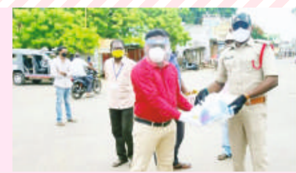
RC Singarayakonda : Face Protection Masks Distribution