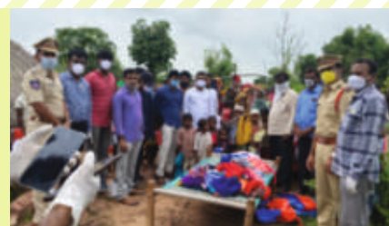
RC Hanamkonda : Rs.1 Lakh worth Medicines and groceries distribution