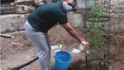
RC Ameerpet Hyderabad : Tree plantation