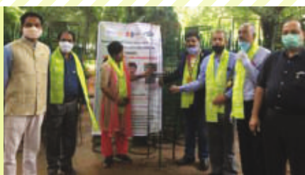
RC Hyderabad Mega City : Tree Guards presentation to GHMC