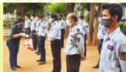
RC Hyderabad Gachibowli : Mask distribution to GHMC Workers