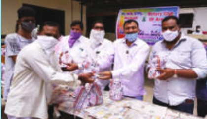
RC Armoor : 5000 Clay Ganesha Distribution