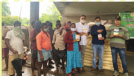
RC Greater Hyderabad : Fertilizers & Micronutrients Distribution to Farmers