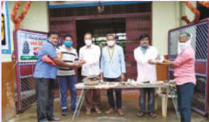
RC Warangal : Clay Ganesh Idol Distribution