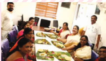
RC Secunderabad Icons : Cultural Celebration - Peace Making Efforts