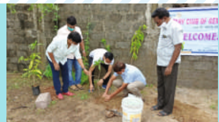
RC GEMS Nizamabad : 10,000 Saplings Plantation