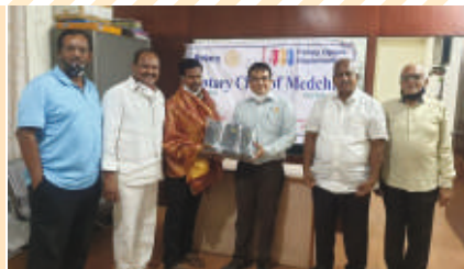
RC Medchal : Face Mask Distribution