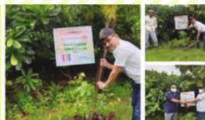
RC Hyderabad East : Tree Plantation Programme