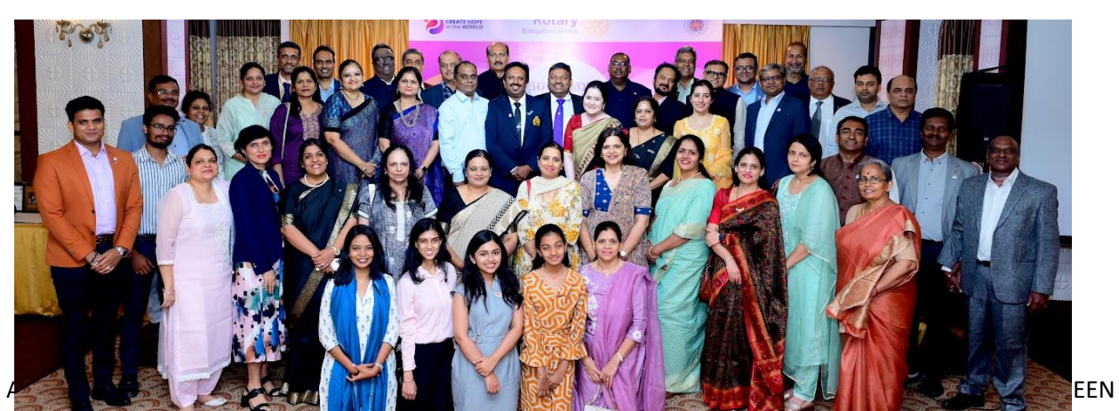
A CONSISTENT AND OUSTANDING PERFORMERS WITH THE PROJECTS THEY EXECUTE YEAR ON YEAR