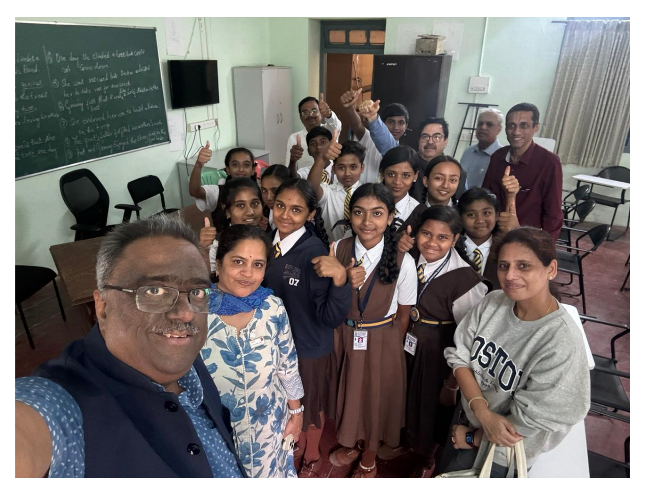
Figure 11: Formation of New Interact Club at Rani Sarala Devi School