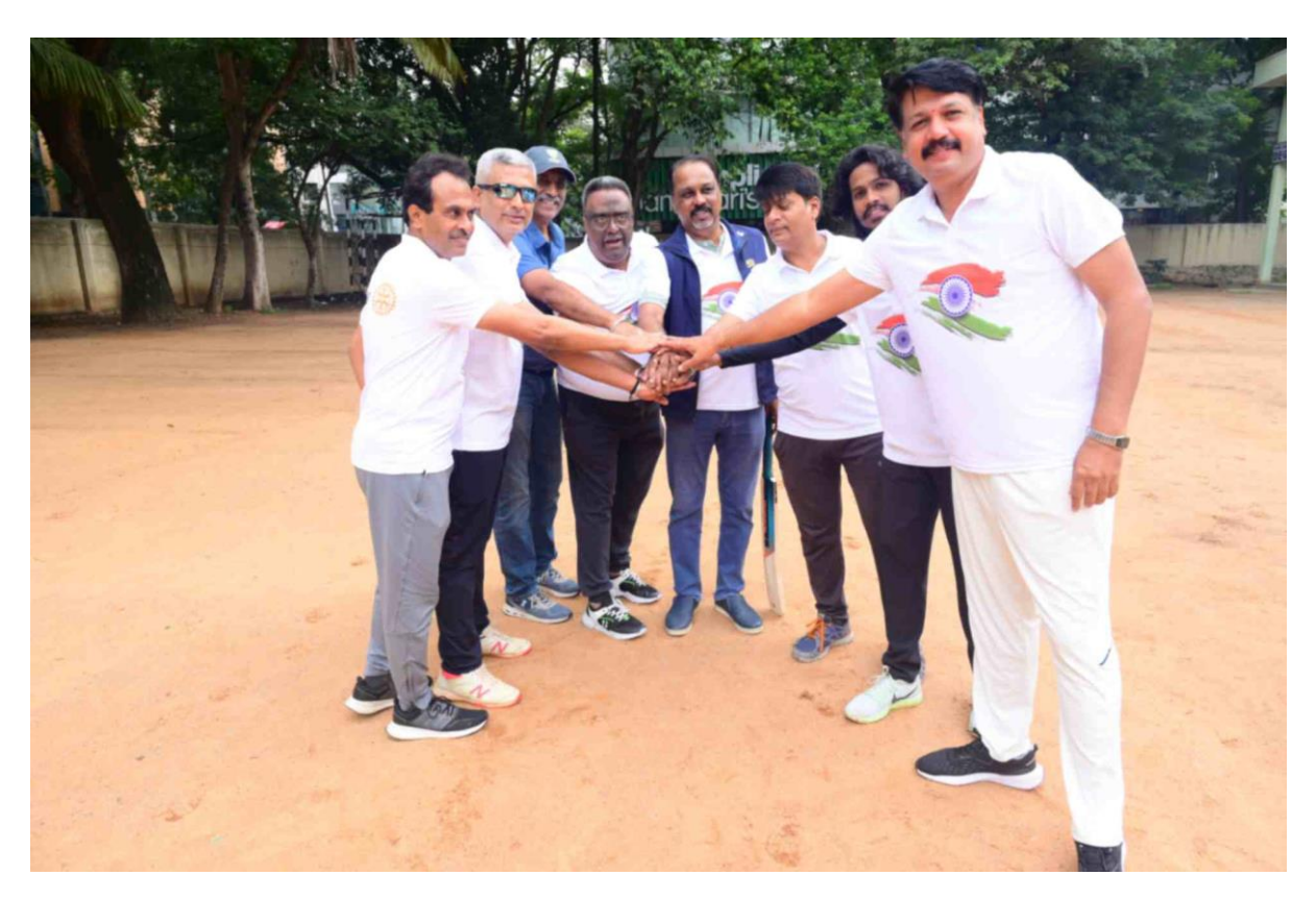
Figure 4: Friendship Day Cricket – DG, Club Presidents with Captains