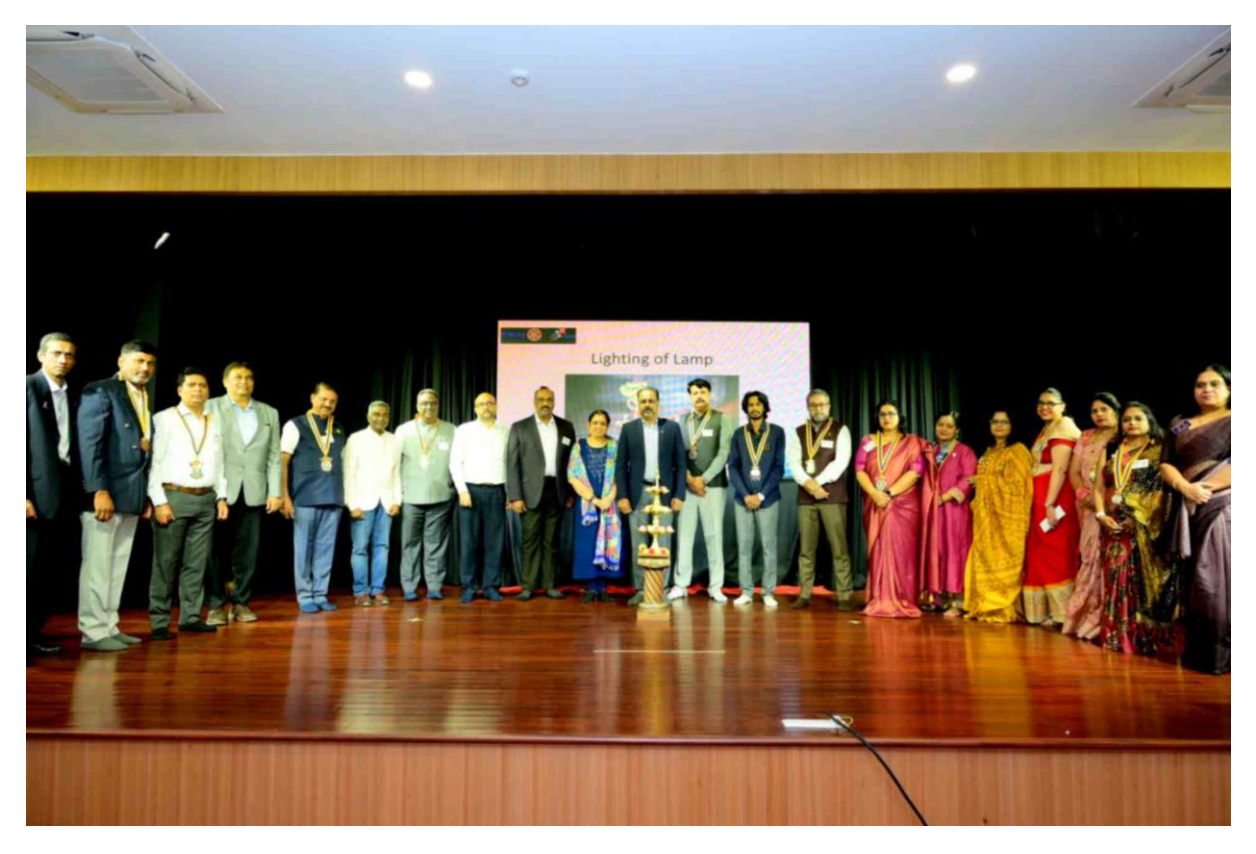
Figure 3: DG, Co-Presidents and other District Officials during Joint Budget Speaker Meet