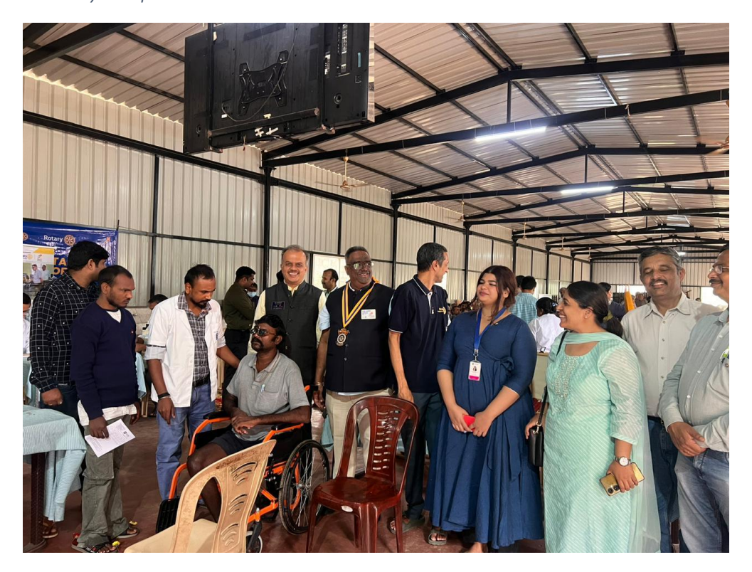
Figure 8: Inmates undergoing Eye screening at AiR Humanitarian Home, Bannerghatta