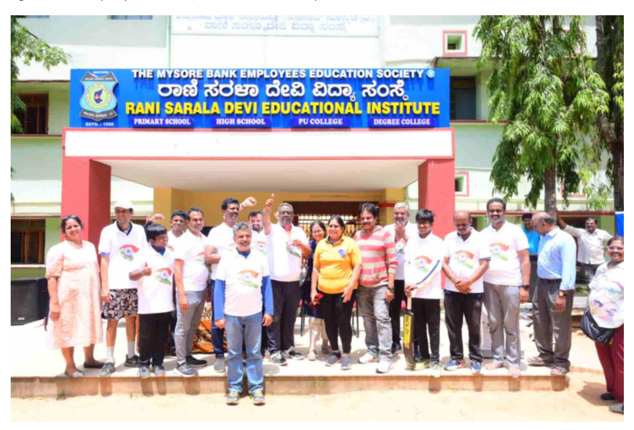
Figure 5: Rotary Club of Bangalore Prime with Runners up Trophy