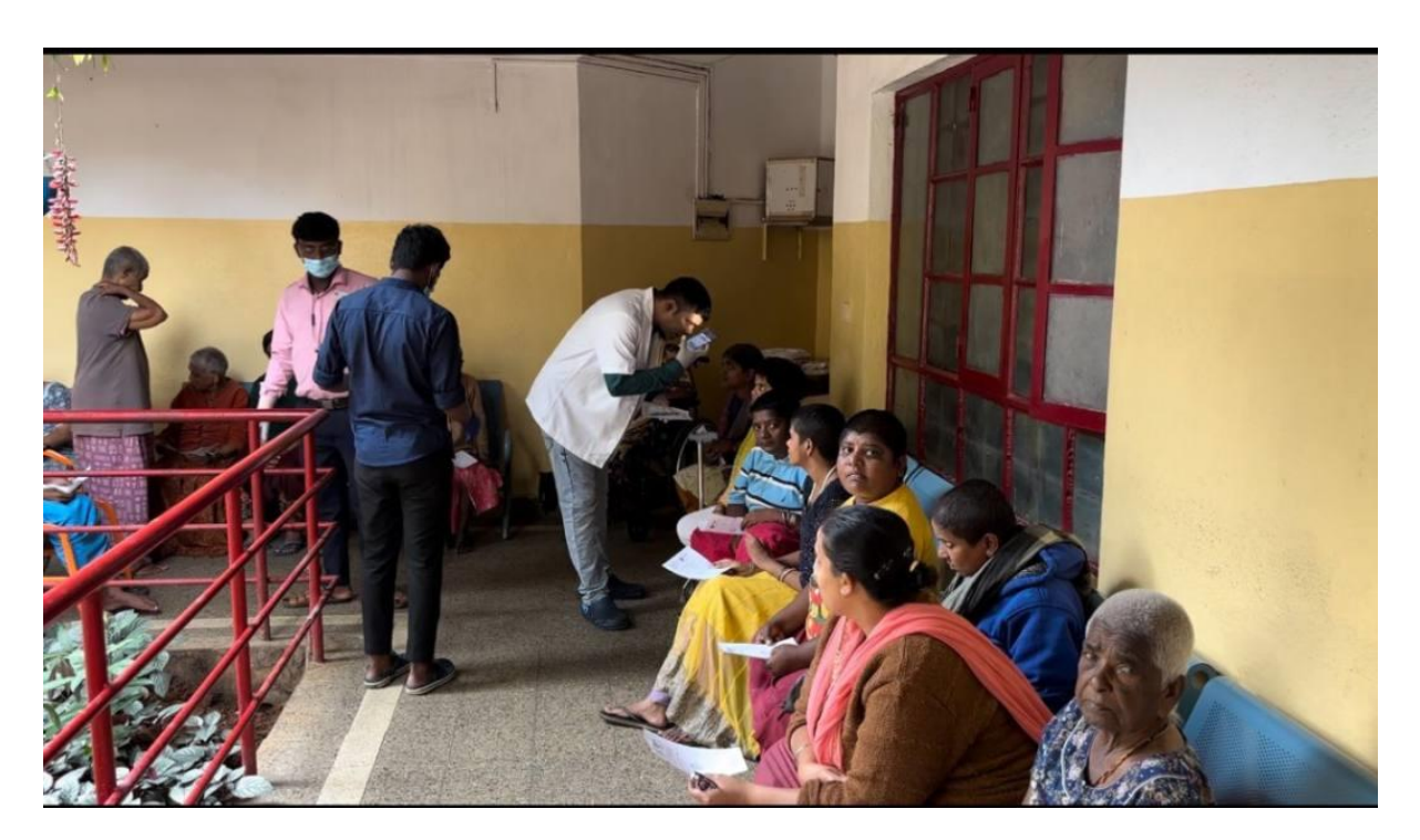
Figure 9: Inmates undergoing Eye Screening at AiR Humanitarian Homes, Chikka Gubbi