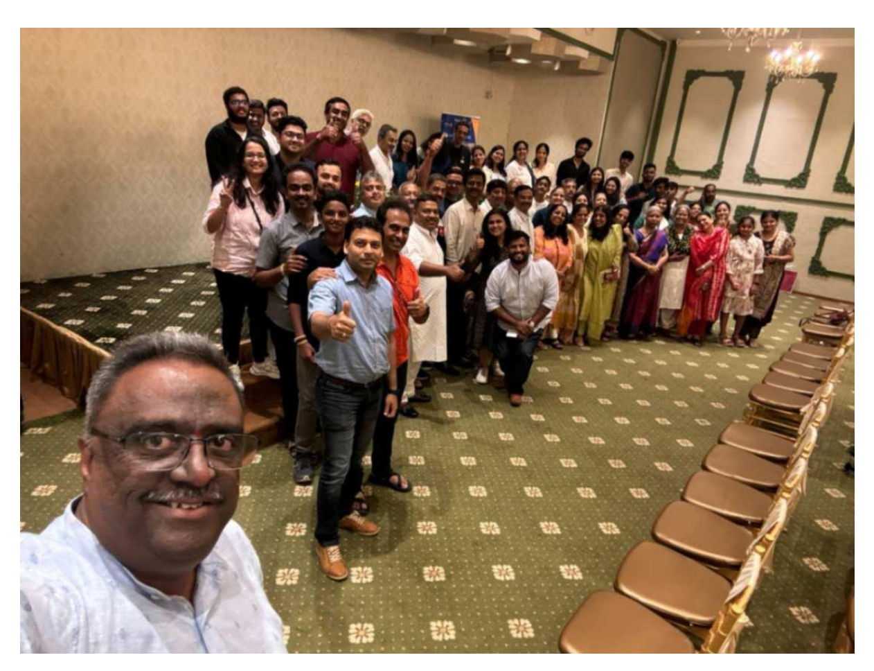
Figure 6: Members and family celebrating Rakshabandhan and Rotaract President Installation on Aug 15th