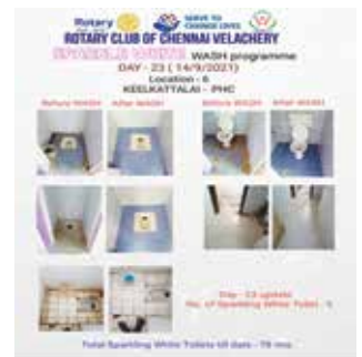
Sparkle White – RCC Velachery