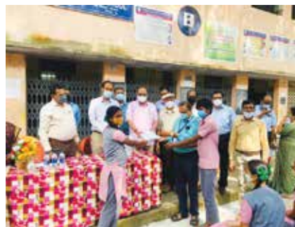
WASH Co Protect GCC Schools