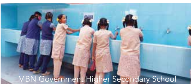
MBN Government Higher Secondary School