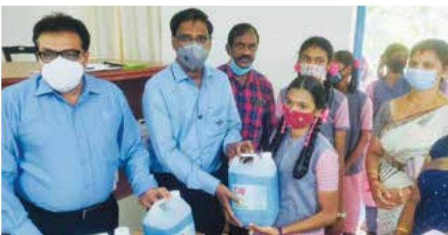
WASH Co Protect, Government Schools

RC Madras Central has executed significant WASH project under Global Grant benefitting a few Govt schools. These projects will be formally inaugurated in the first week of March. ■