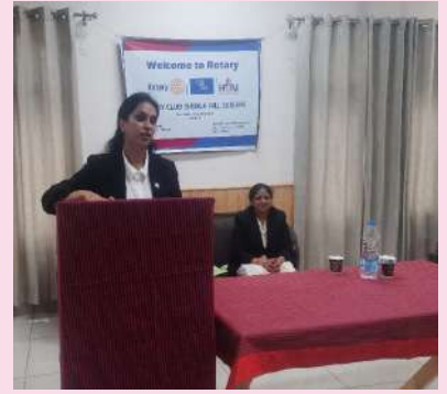
Legal Aid Camp