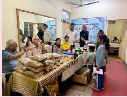
Mother & Child Care