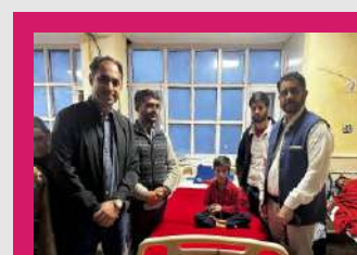
Shimla Heartline Project – Free Heart Surgery for children below 16.