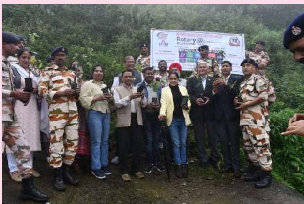
Harela Campaign with ITBP