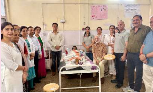
Donation of Sitting Stools to Hospital