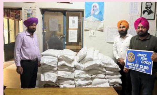
Ration to Flood Victims