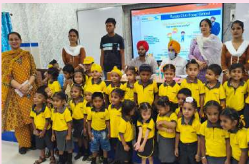
Dental Health Camp for Kids