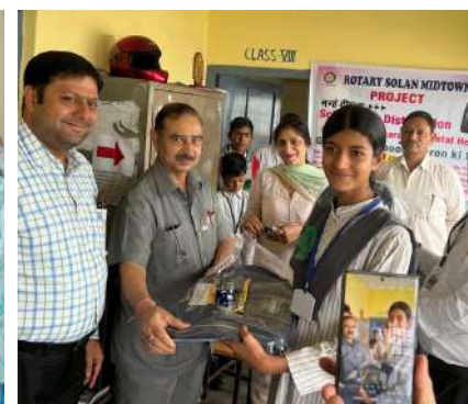
RC Solan Midtown