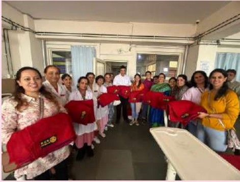
Blankets Distribution at Hospital