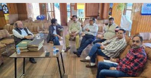
Rotary Club Shimla goes On Air FM 106.4 – Sharing 66 Years of Service