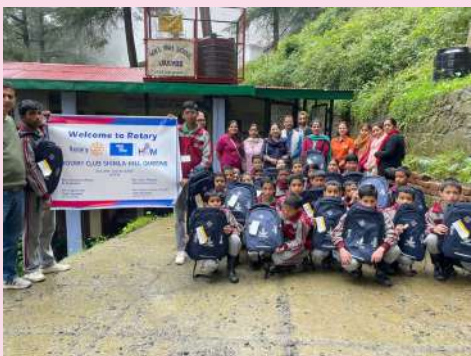
Nanhe Deepak – School Bags