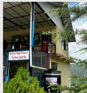
Rain Water Harvest- ing at GHS Sanhog