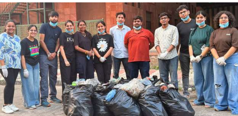
Cleanliness Drive at New Sabzi Mandi grounds in Phase 11, Mohali, organized by Rotaract Club of Amity University, Punjab where more than 30 large bags of trash were collected.