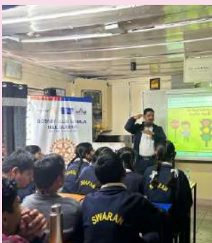
Traffic Awareness Talk