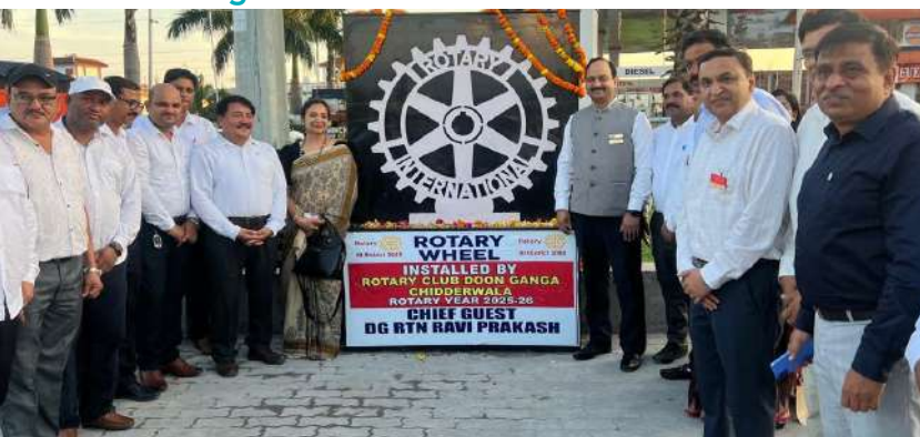
RC Doon Ganga Chidderwala

PEHCHAAN is a landmark Rotary initiative designed to strengthen Rotary's public image and create a lasting identity in our communities. Through this project, the Rotary Wheel - a universal symbol of service and goodwill - is being installed at prominent locations across the district. The district provides the Rotary Wheel free of charge , while clubs proudly take responsibility for identifying the sites and arranging the installations.