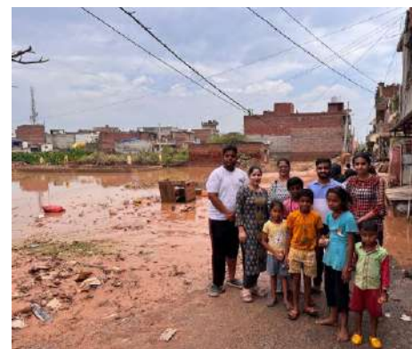
Flood Relief Service by Rotaract Club Youth Ambala Central