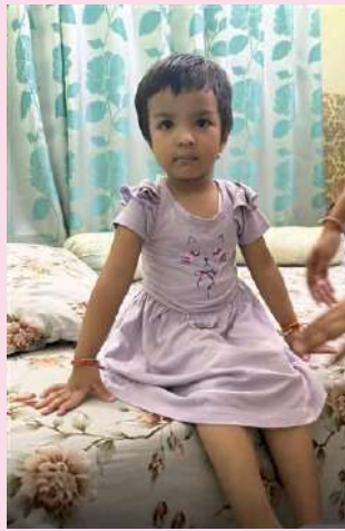
Heart Surgery of 3YO