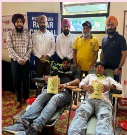
Blood Donation Camps