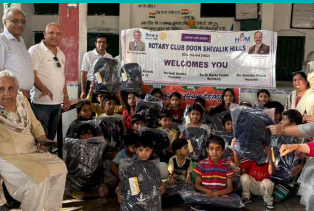
RC Doon Shivalik Hills