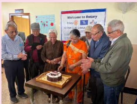
Senior Citizen Day Celebrations