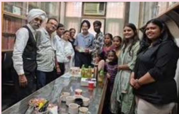
Raksha Bandhan with Girls of Umeed Fdn.