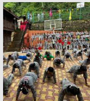
Self Defence Camp for Girls