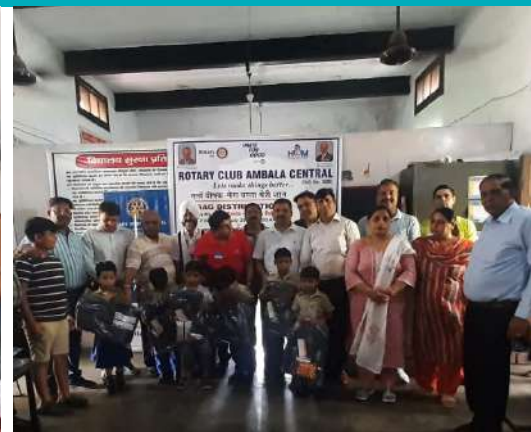
RC Ambala Central