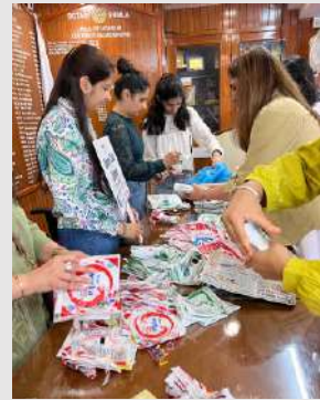
Milk Bag Recycling 1st Co-Pilot Project