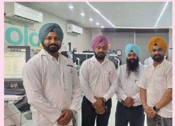
Cath Lab Installed