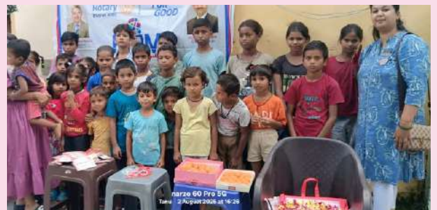
Friendship Day with Slum Children