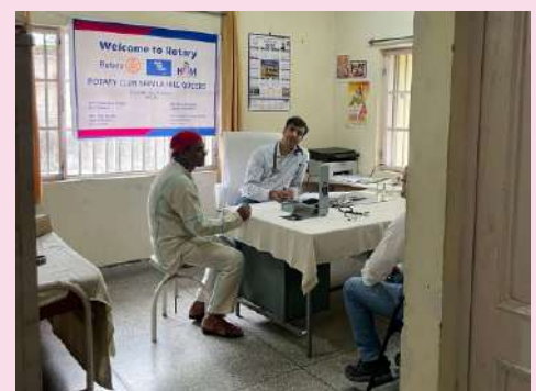
Cardiology Camp at Jail