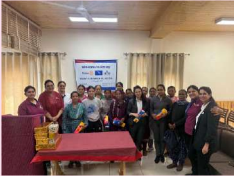
Sanitary Pads Distribution