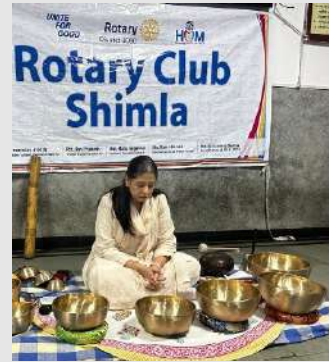
Sound Healing Session at Himachal Hospital of Mental Health & Rehabilitation

Rotaract Club at Govt College Excellence Sanjauli