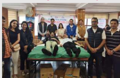
Blood Donation Camp on Independence Day