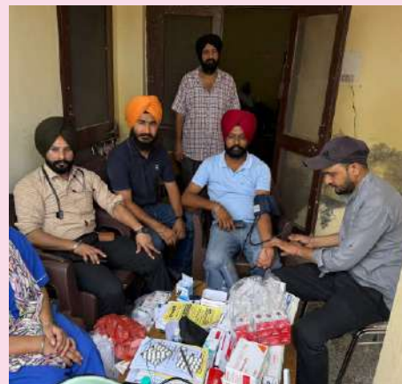
Health Check-Up Camps