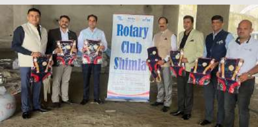
Developed and Distributed Kangaroo Mother Care baby carrying bags that offer mobility and ease to working mothers.