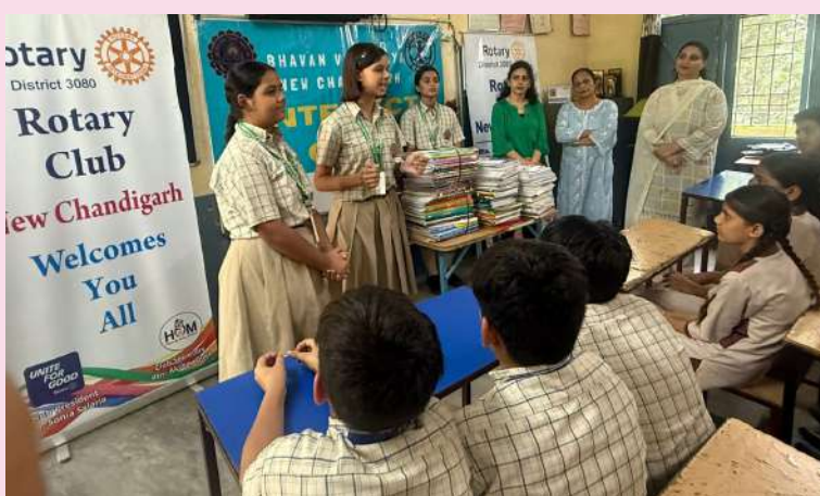
Books & Almirah Donation to a School