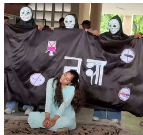
Street Skit on Fighting Drug Menace by Rotaract Club of GKNITM on International Youth Day

Ganpati Mahotsav 3080 was a resounding success, bringing together 11 Rotaract clubs from District 3080 in a celebration of unity and devotion for three days