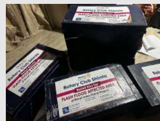
Relief Material for Flood Victims