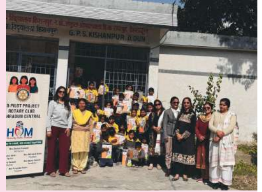
Pariksha Pe Charcha