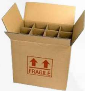
UNIVERSAL BOX WITH HONEY COMB USED IN LIQUID FILLING UNITS