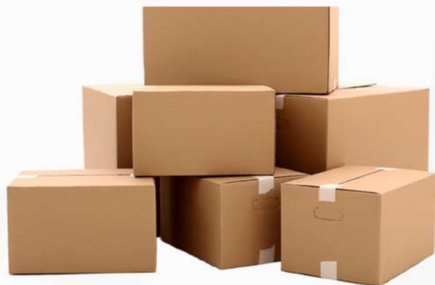
UNIVERSAL BOX - 3,5,7 PLY USED IN ALL PACKING FORMS