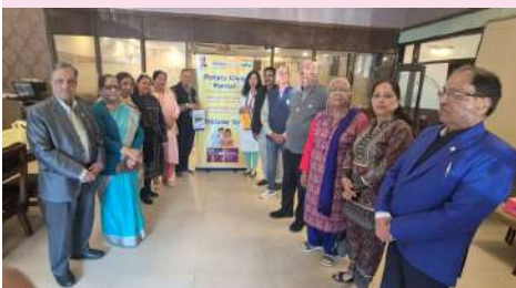
Flag Exchange with Rotary Club Wyndham