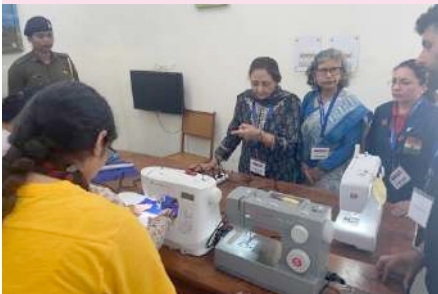
Sewing Machines to Jail