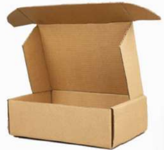
LOCK TYPE INNER CARTON