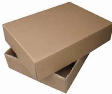
TOP AND BOTTOM TYPE BOX USED IN FOOD AND MEAT PROCESSING