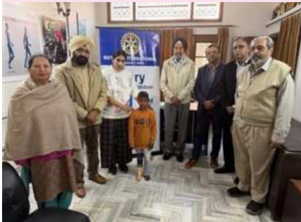
Artificial Limb Replacement