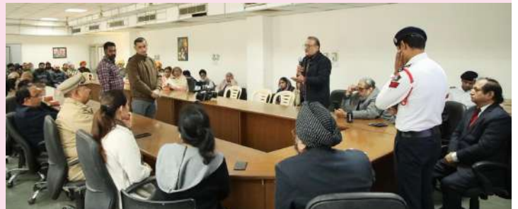
Divya Kala Mela in Chandigarh for Persons with Disabilities