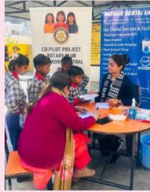
Dental Check Up