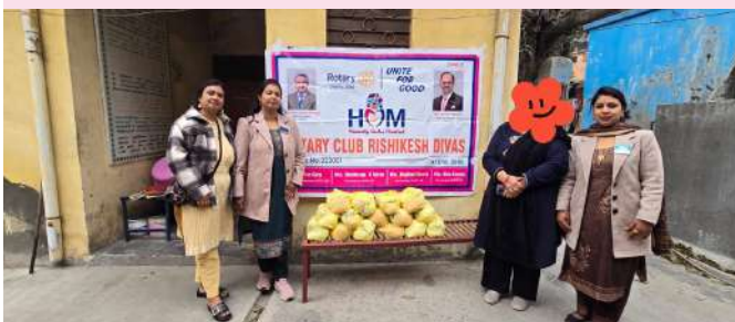
Prem Bhoj Seva