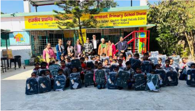
School Bags Distribution