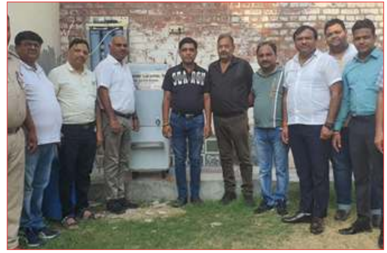
INSTALLATION OF WATER COOLER AT WOMEN CELL IN DISTRICT JAIL RC SOLAN