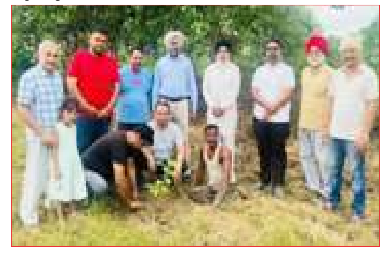
TREE PLANTATION ON BARREN LAND