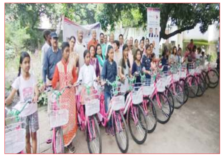
22 CYCLES GIVEN TO GIRL STUDENTS