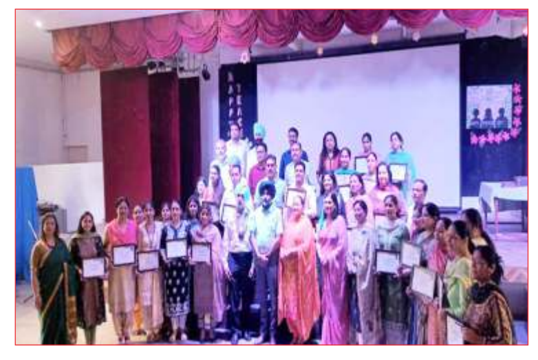
HONORED 41 TEACHERS