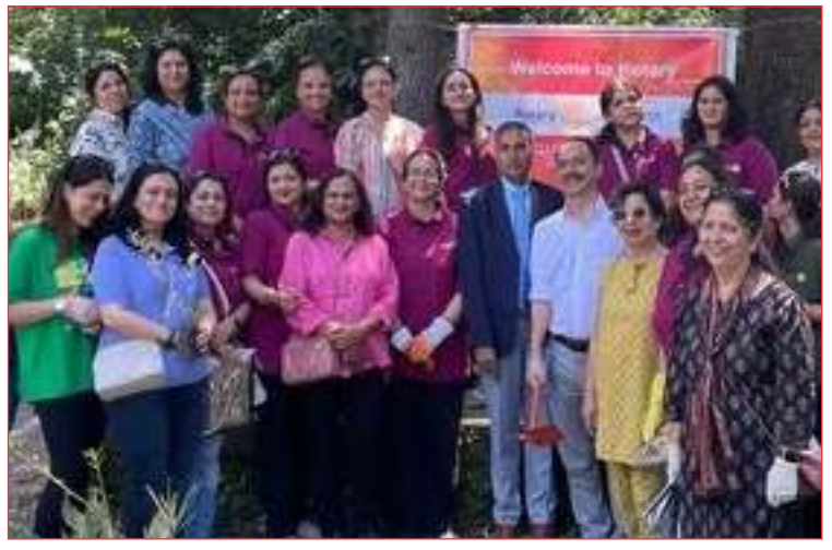
HONORED TEACHERS AND TREE PLANTATION BY THEM