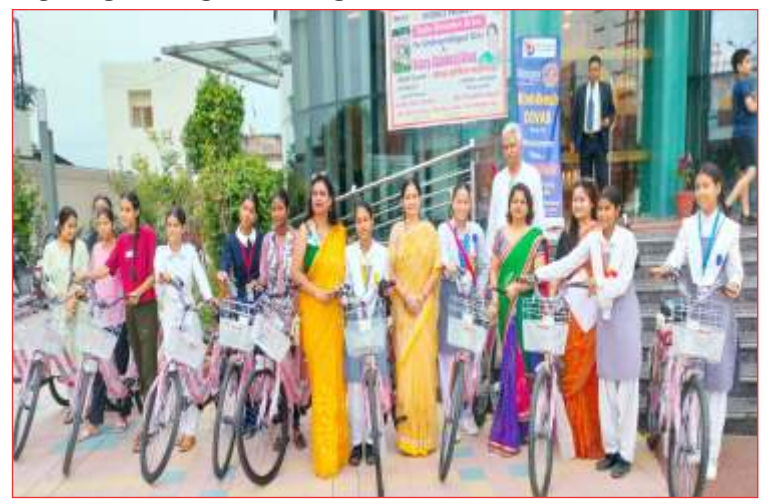
CYCLES DONATED TO GIRL STUDENTS