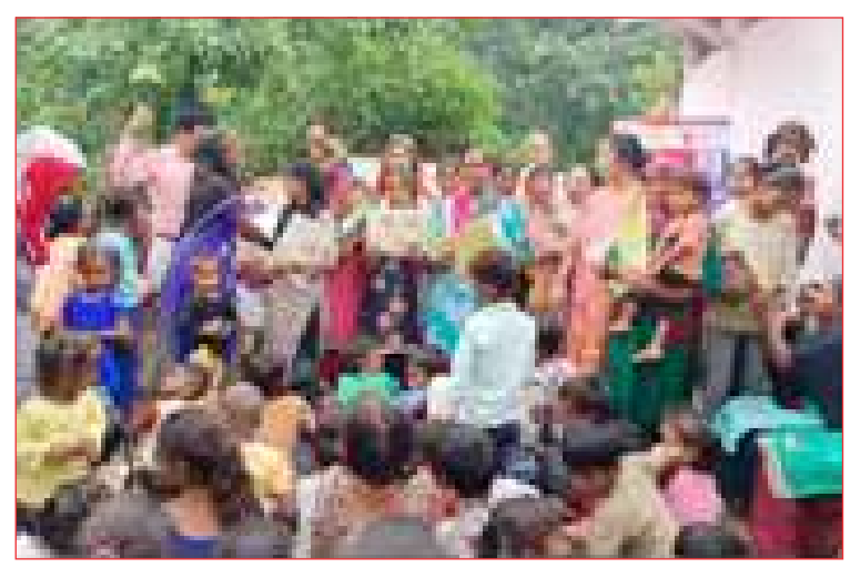
LITERACY PROGRAMME FOR SLUM AREA