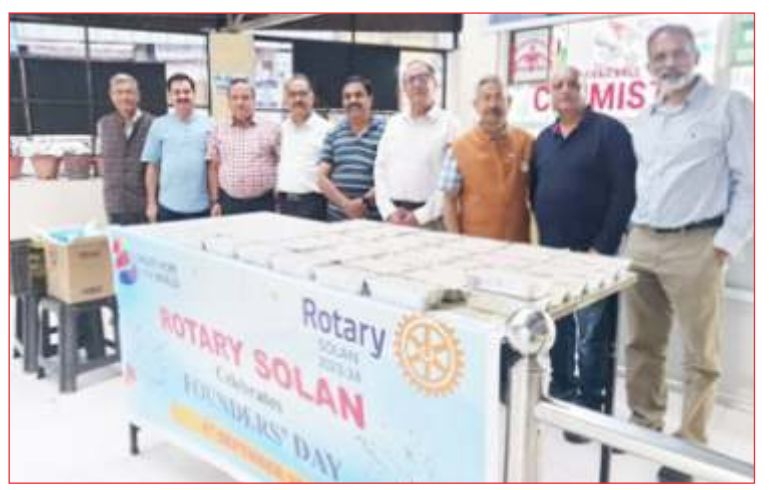
DISTRIBUTED FOOD TO 120 PATIENTS ADMITTED IN REGIONAL HOSPITAL