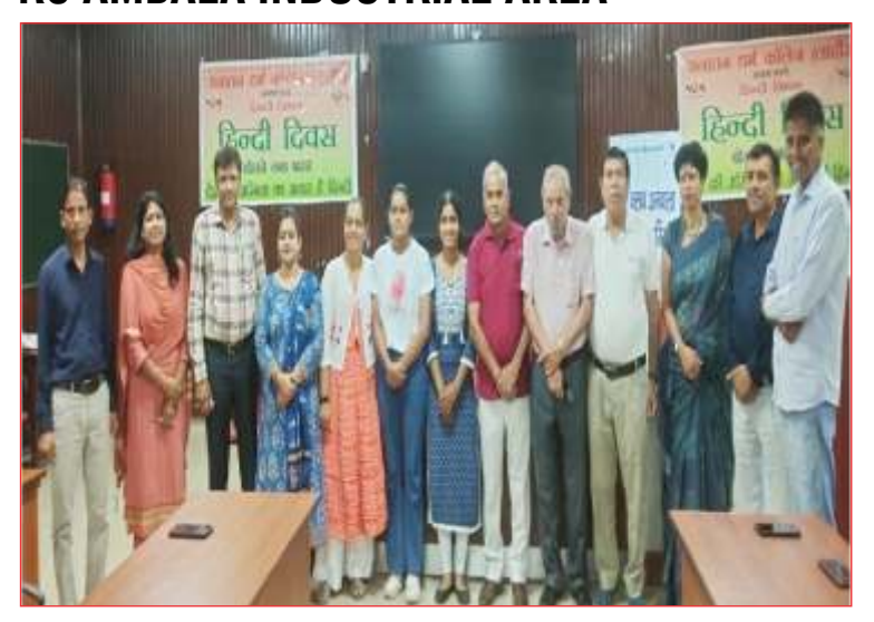
CELEBRATED HINDI DAY