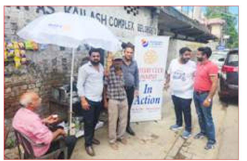
UMBRELLA DISTRIBUTION TO STREET VENDORS