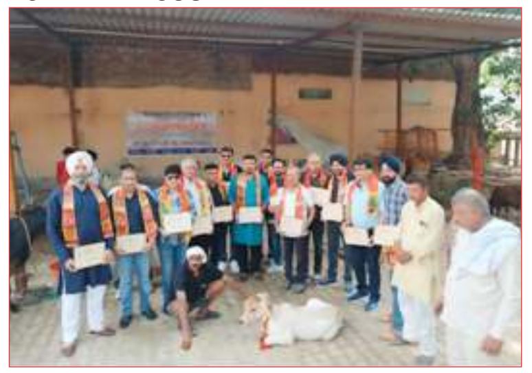
CONSTRUCT A COW SHELTER