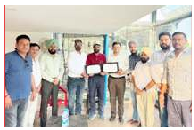
HONORED SPORTS TEACHERS