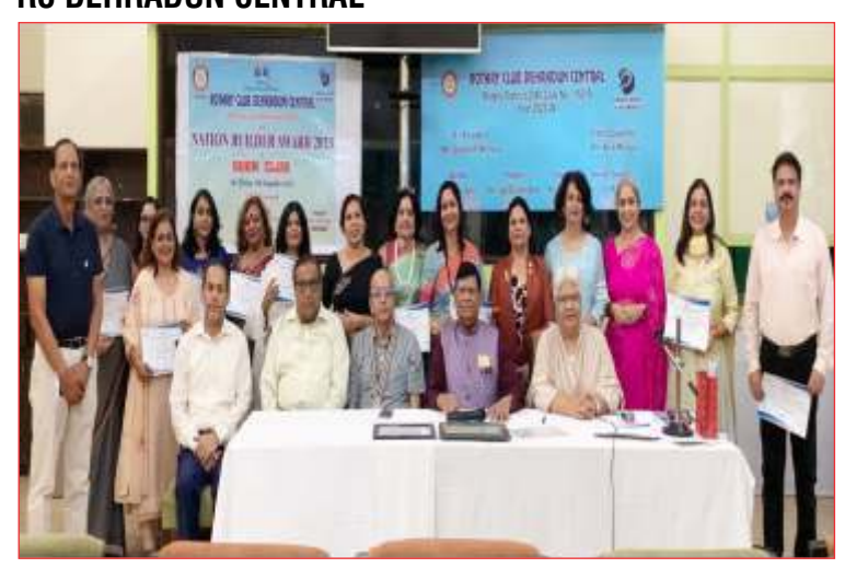
FELICITATED 20 TEACHERS OF DIFFERENT AVENUES