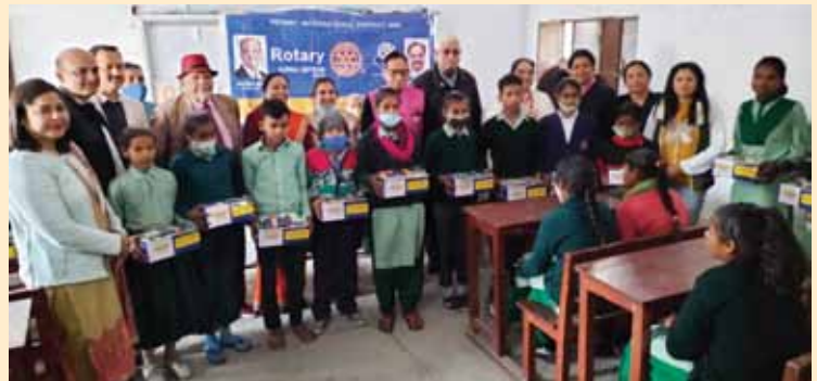
Donated Shoes & Socks, Copies, Pens / Pencils at Govt. Sr. Sec. School Model Town Karnal & Govt. Sr. Sec. Girls School, Sec-13, Karnal.