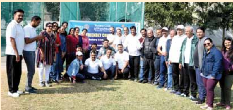
Friendly Cricket Match held with the team of Dainik Bhaskar