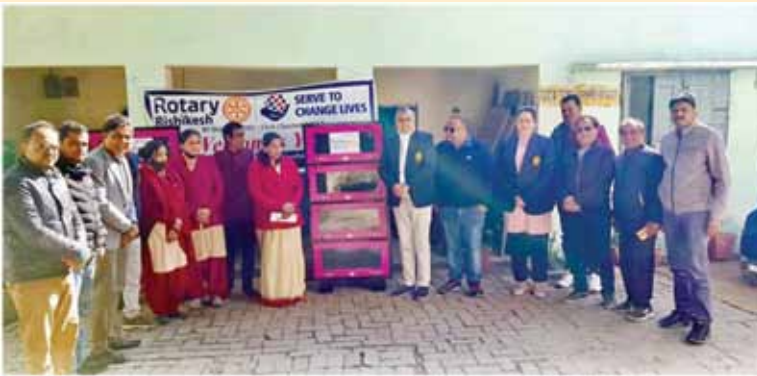
Bookshelves Donated for Library in Govt. School