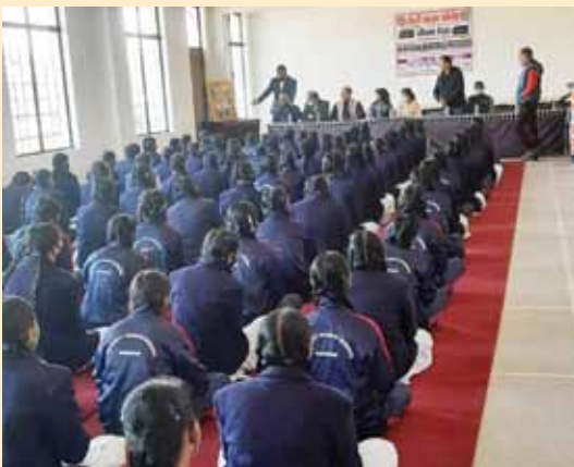
A health camp organised for girls of ND Public School