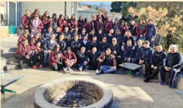
Two Day Trip to Mussoorie for Club Members