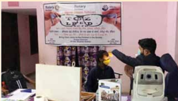
Eye checkup camps under RILM Ujjwal Drishti Project.