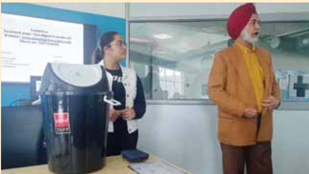
Talk on E-Waste Management to employees of M/S Ramani Precision Machine Tools