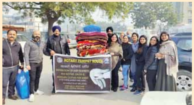
Distributed Woollen Blankets, Milk Bottles , Raw Daliya and Winter Clothes for New Born Babies at Civil Hospital Maternity Ward, Panipat