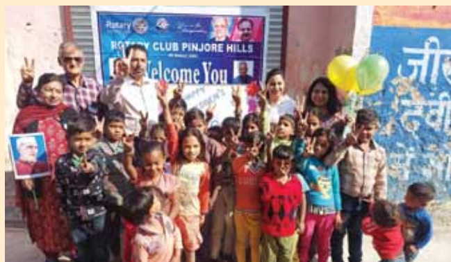
Sweets, Chocolates, Books and Stationery Distributed to Students