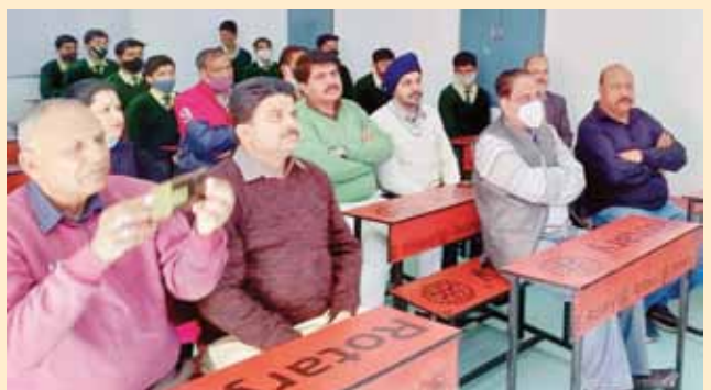
Donated 40 School Benches at Govt Boys Sr Sec School , Taruwala Paonta Sahib