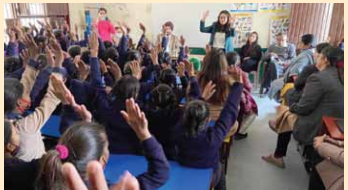
Oral Hygiene and Dental Care Checkup Camp at Apne Foundation Shelter HO, Akal Ashram Colony, Sector 77, Mohali