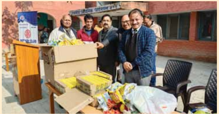
Refreshment to 200 Children of Govt School