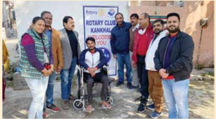
Wheel Chair Provided to a Disabled Person