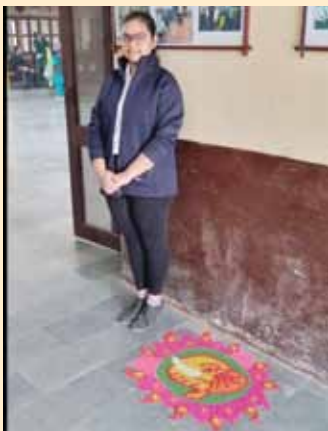
Rangoli competition held in Deaf and Dumb School on World Disabled Day