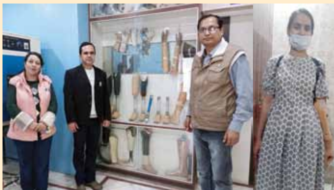
Artificial Hand Installed to a girl under Project SAHYOG