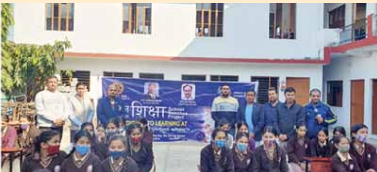
40 Desk/Bench set handed over for students of Nalanda Shikshan Sansthan under District Project.