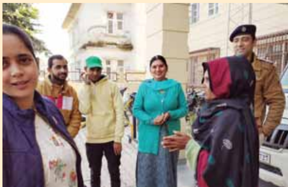
Old Lady Found and Handed over to her son in UP