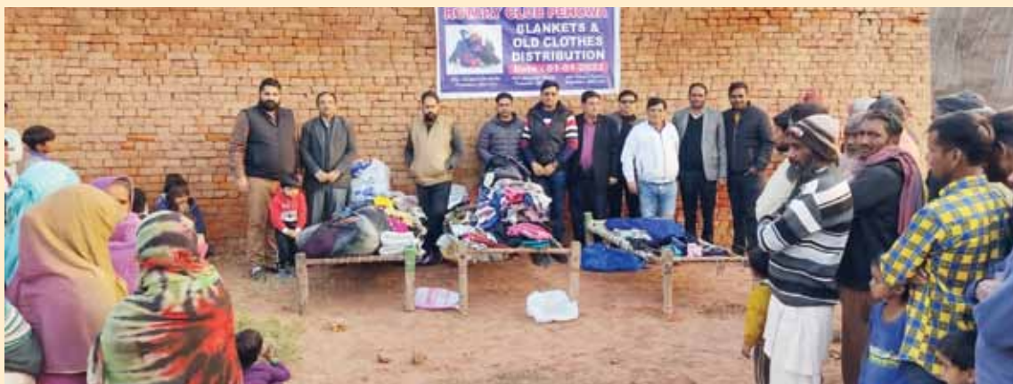
Distribution of Blankets and old clothes to road side and slum area people.