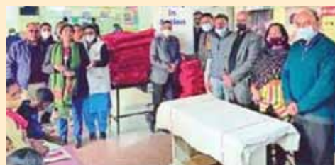
100 Blankets Donated in General Hospital, Sector 6, Panchkula