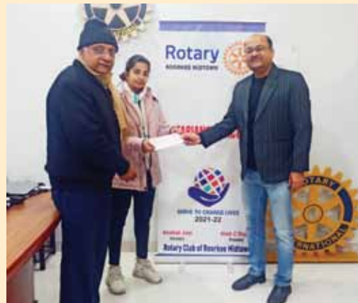
Scholarship to MBBS Student