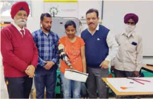
Camp to Fitment of Customize Extender on Beneficiary