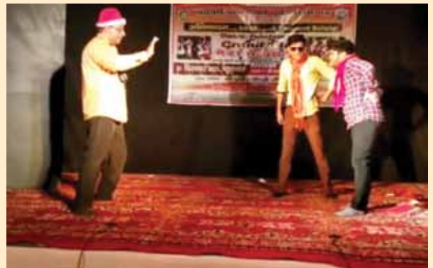
A Play MERA VAJOOD Organised