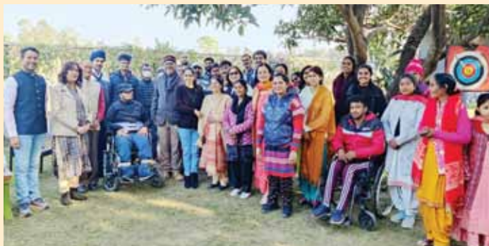
Organised Brunch and Activities for the Special Children of Anugrah Foundation, Vikasnagar.