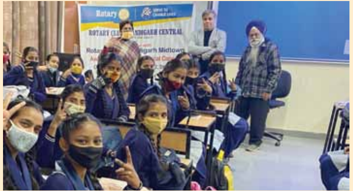
Awareness Camp on Cervical Cancer