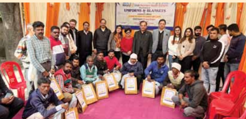
Distribution of Uniform and Blankets to Swatchkaar