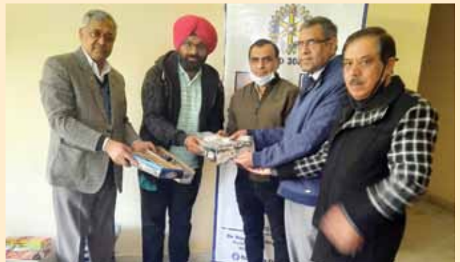
Donated Woolen items at Old Age Home in Ratwara Sahib Campus