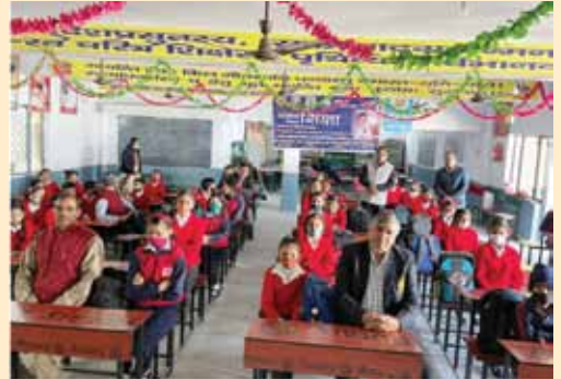
40 Benches handed over to Saraswati Shishu Mandir under Samman se Shiksha Project