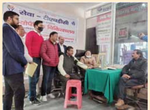
Free Homeopathy Medical & Medicines Distribution Camp