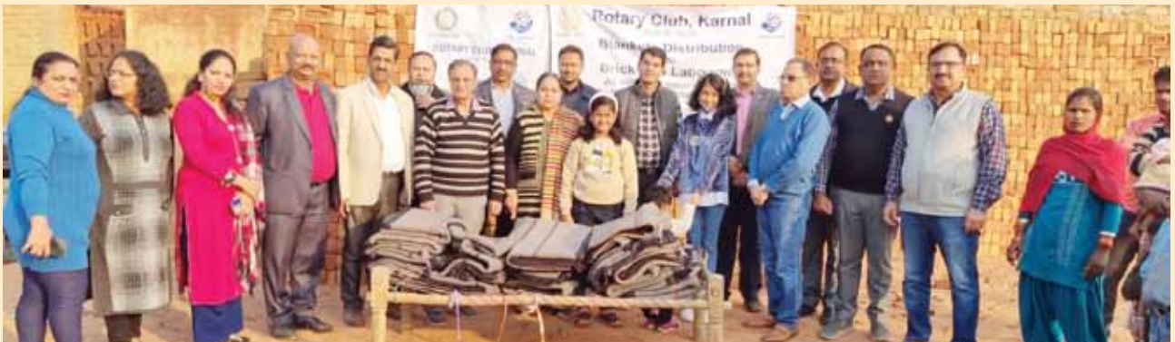
Blankets Distribution Project organized at a Brick Klin near Village Samora in Karnal