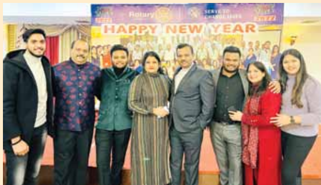
New Year Celebration