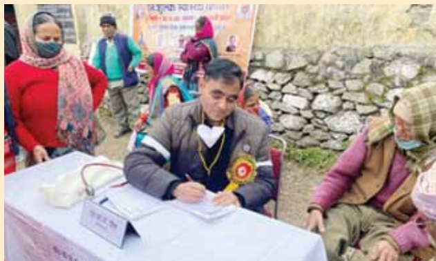
Mega Health Checkup Camp at Village Jakholi in Rudrprayag District