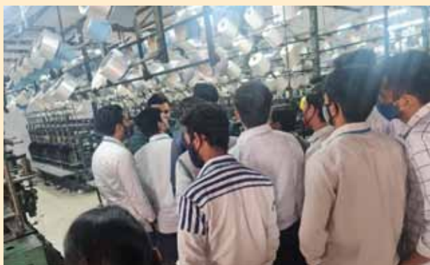
Industrial Visit tour for College Students