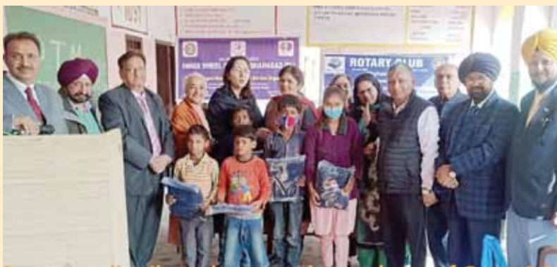
250 Sweaters Distributed among the Students of Govt. Schools.