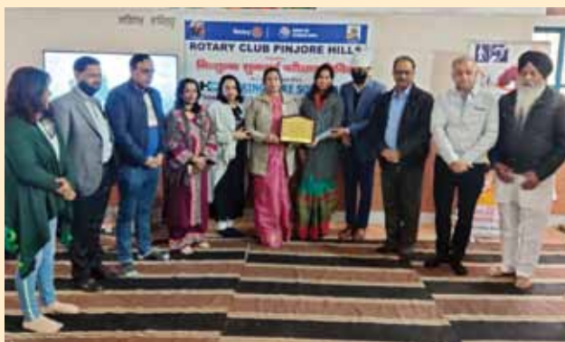
Hearing Awareness Camp at Singh Sabha Gurdwara