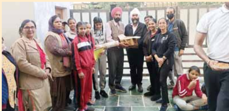
Stationary Items Distributed to Children of Jyoti Swaroop Kanya Ashram Kharar