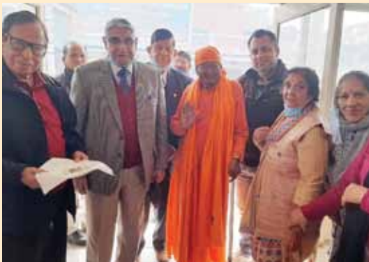
Physical and Mental Fitness Camp