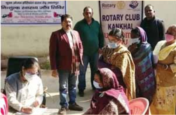
Medical Checkup Camp for Women Prisoners