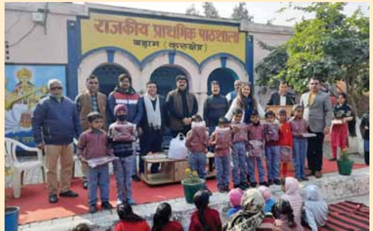
Sweater Distribution in Govt Primary School, Village Badam, Kurukshetra