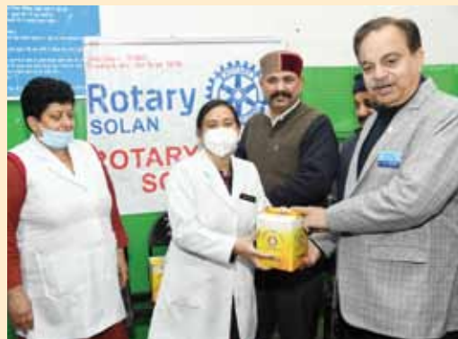
Donated 50 Tiffin Boxes to the Nursing Staff for their Services given in COVID times