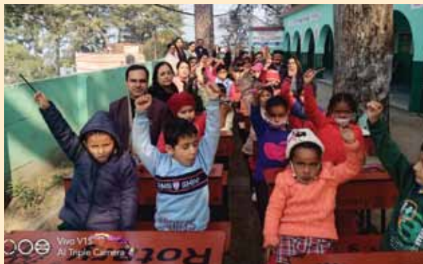
20 School Benches given in Govt Primary School for Boys at NAHAN