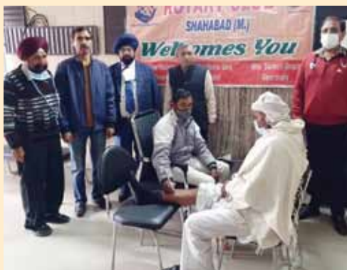
Medical Checkup Camp