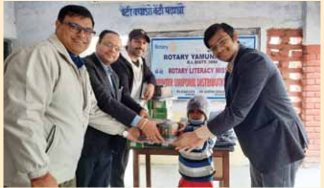
Distributed Winter Uniforms to 80 Students at Government Middle School, Bhahwargarh