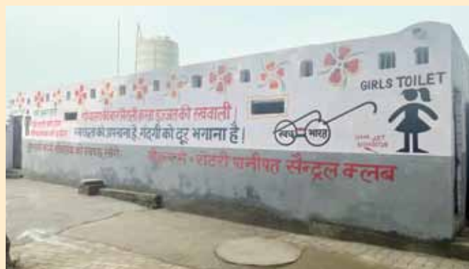
Toilet / Handpump Project at Raslapur Govt Middle School