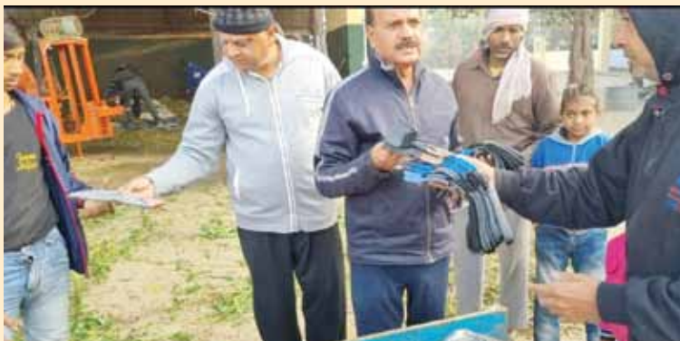
100 Woolen Socks were distributed in Gaushala Ambala Cantt