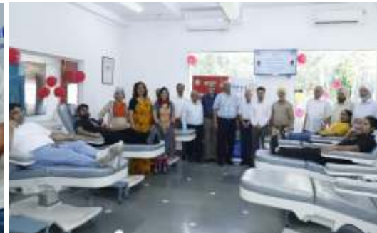
A Total of 30 Units of Blood were Collected.