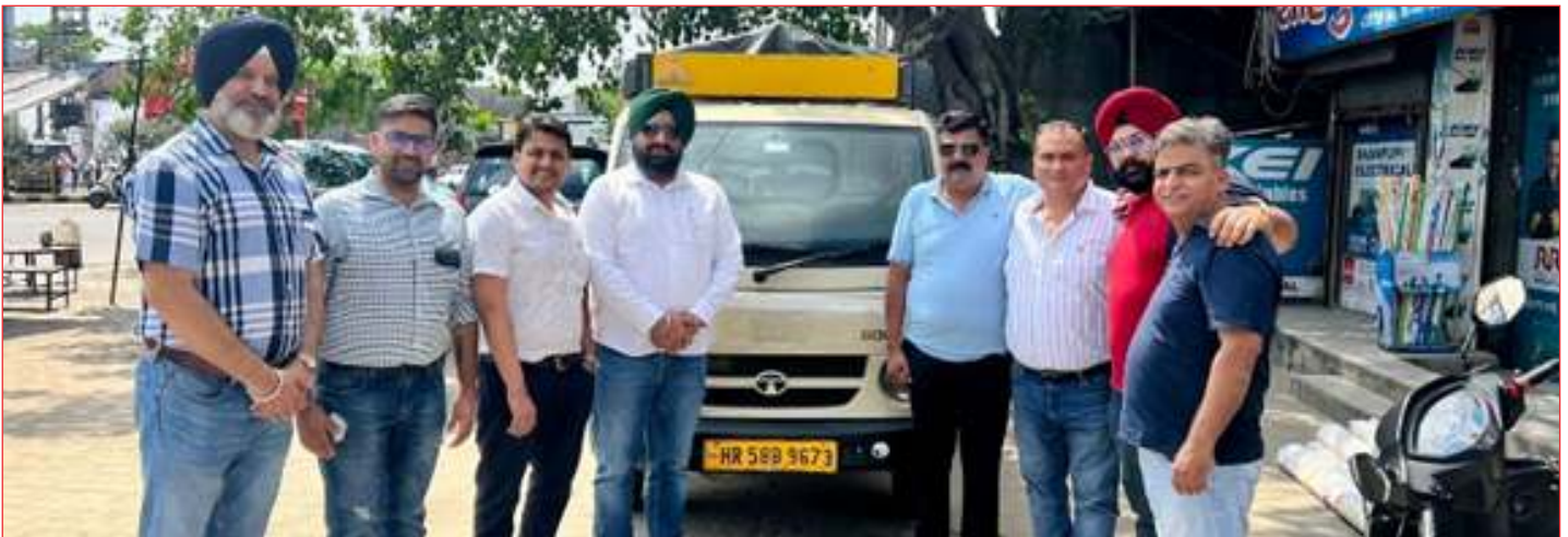
Sent Relief Material to Land Slides and Flood Affected areas.