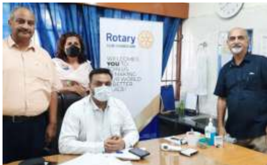
140 pregnant women and lactating mothers were given diagnosis, medicines and advice. 100 tins of sugar free Protein powder