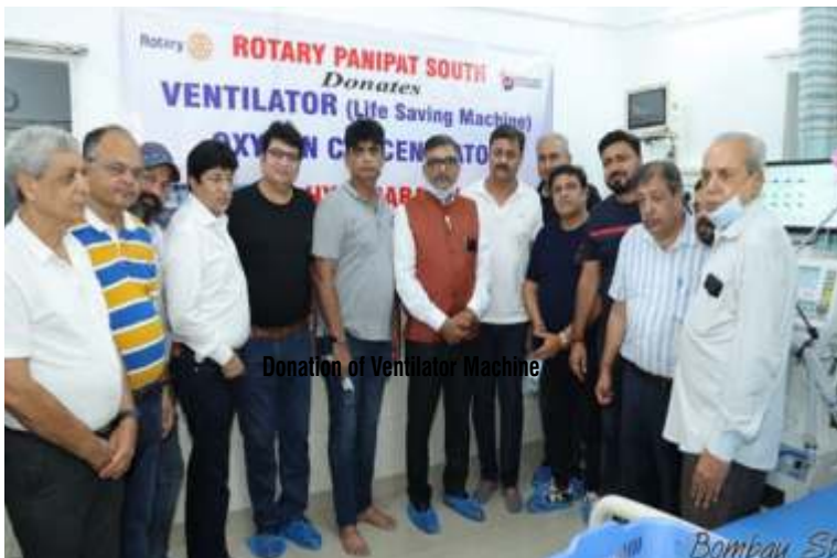
Donated A Ventilator And A Oxygen Concentrator To Hyderabad Charitable Hospital On 16th July.