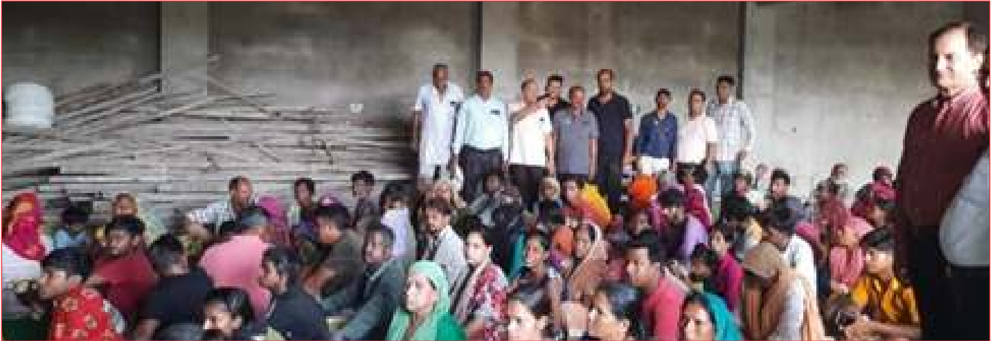
Distributed 2000 Oral Hygiene Kits to Flood affected people.