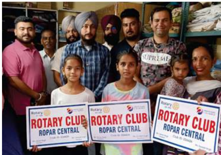
Paid one-month full expenses of shop being run for 6 years to provide clothes to the needy persons