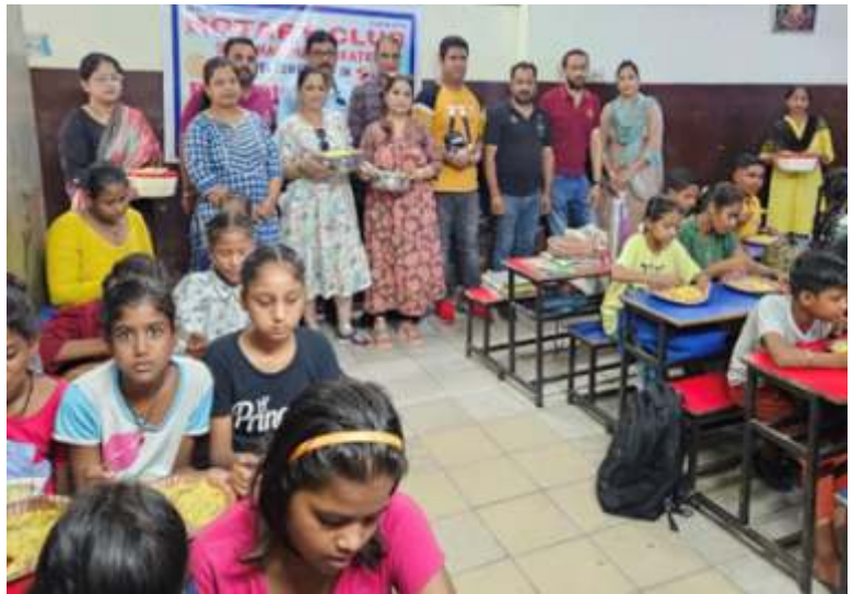
Food and stationery to poor students.