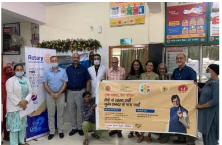
Under TB Eradication Programme Distributed 100 Food Nutrients Packets to the Patients. RC Chandigarh