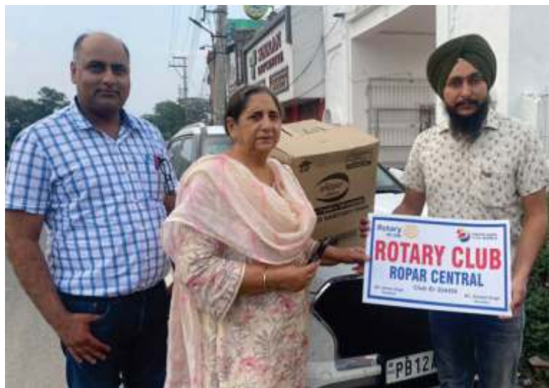
Handing over box of sanitary pads for needy women in the flood affected area of Patiala.