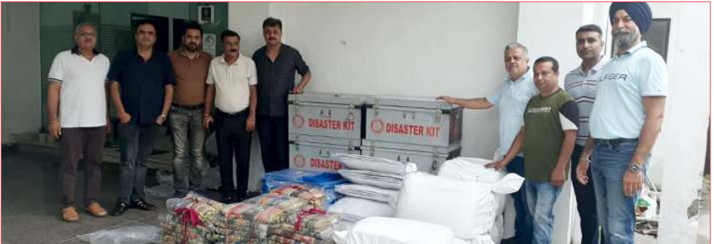
On 18th July Rotary Panipat South In Collaboration With Rotary Mid-town Sent Ration,bed Sheets, Tarpals , Disaster Kits And Utility Items To Flood Victims