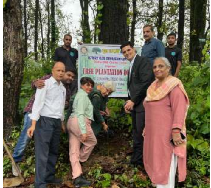
RC DEHRADUN CENTRAL