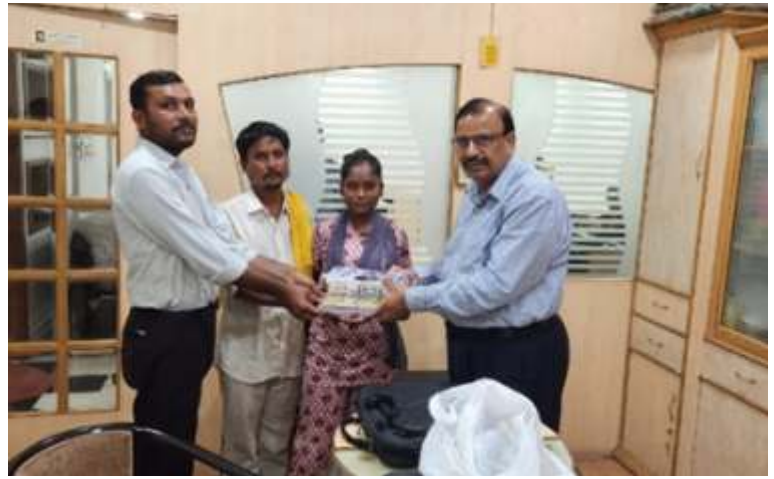
English speaking course by RC Morinda for poor students