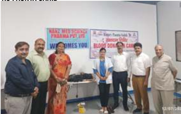
Blood donation Camp - 80 units collected