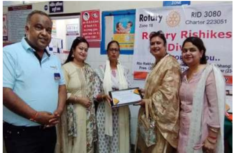
Doctor's Day Celebration