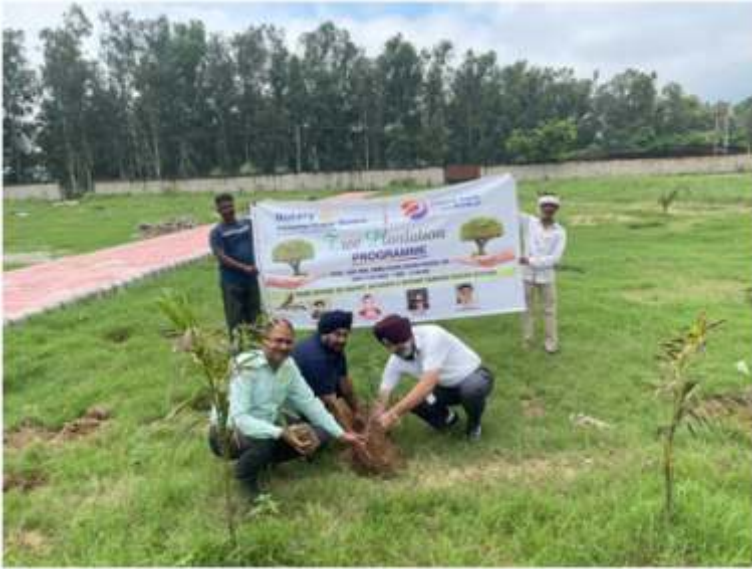
RC YAMUNA NAGAR RIVIERA