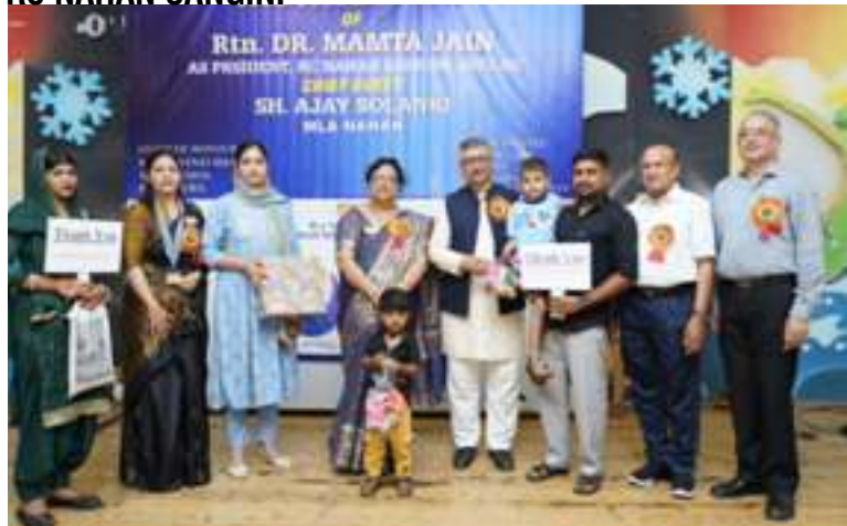
Heart surgeries of children of age 5 years and 7 years.