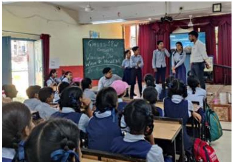
5 WASH sessions were conducted for students at the Govt. school to cover all students.