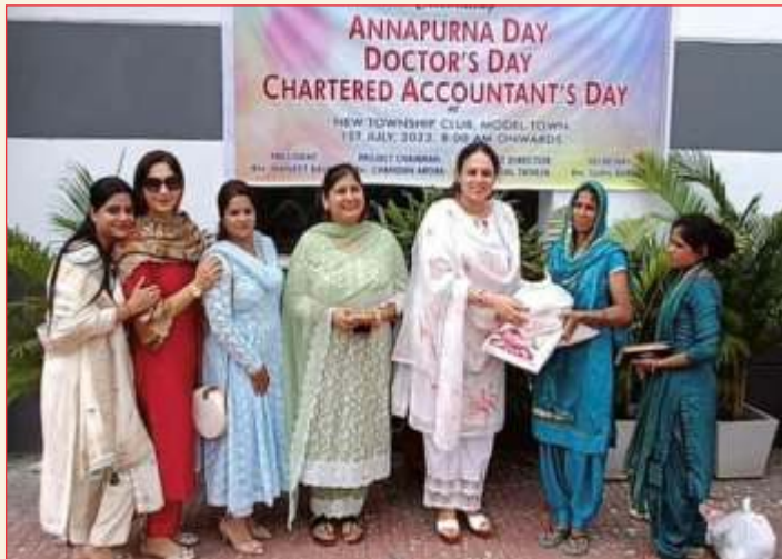
RC PANIPAT SOUTH