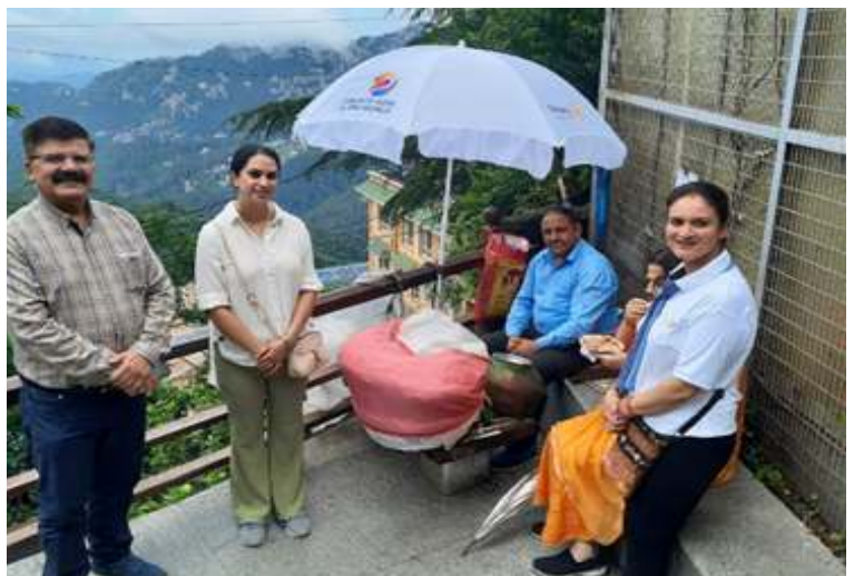
Doctor - CA Day