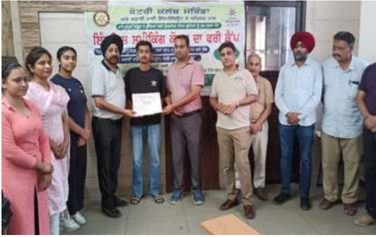
Books donated by by Rotary Ambala to poor students