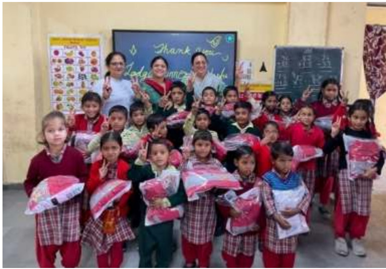
Track suits given to students of primary school.