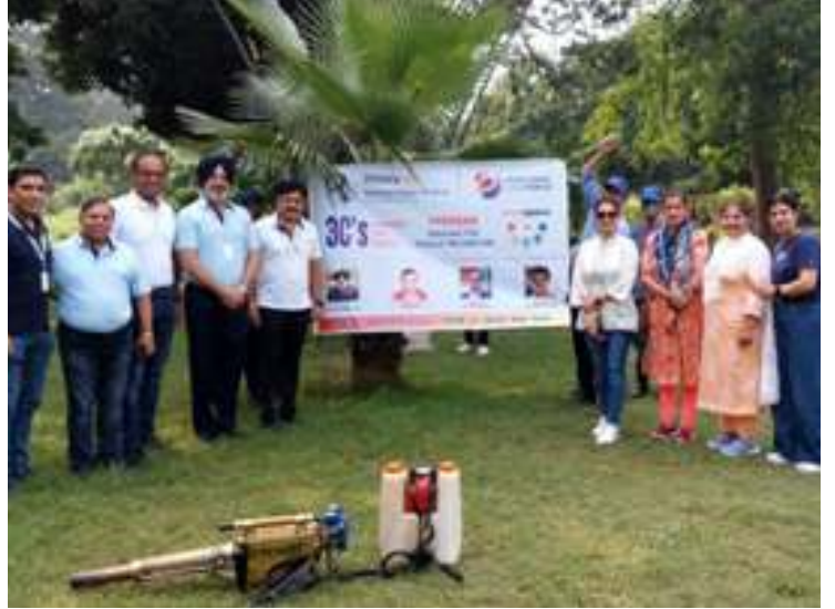
Fogging done by RC Yamuna Nagar Riviera for dengue prevention