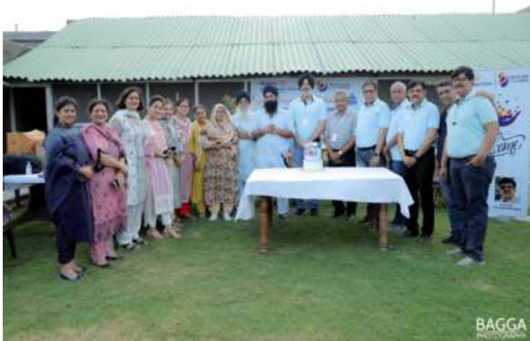
Donated a Gen Set to a NGO who is taking care of home less people