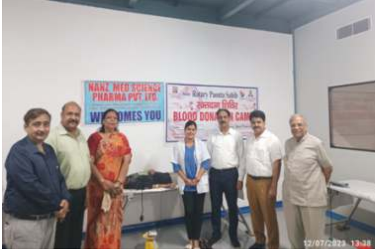
Blood Donation Camp was organised at Nanz Med Pharma 80 unit blood was collected.