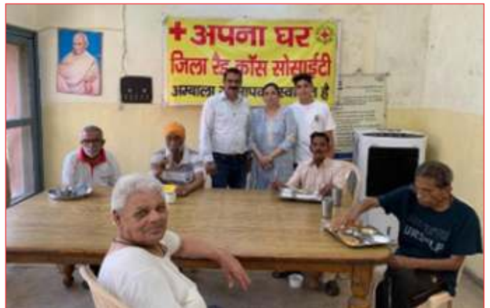
Served food to inmates of Old Age Home.