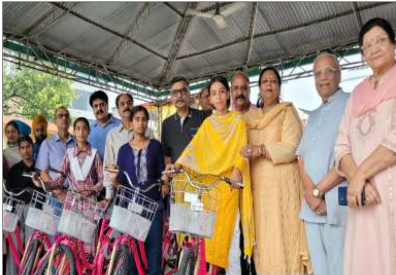
Donated girls cycles to the students of Government Girls Senior secondary School main bazar Paonta Sahib