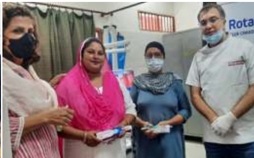
Under Oral Health Programme, 50 patients were checked.