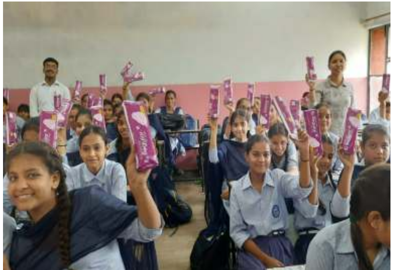
Distribution of sanitary napkins to adolescent girls from the government school under awareness to hygiene project. RC Chandigarh