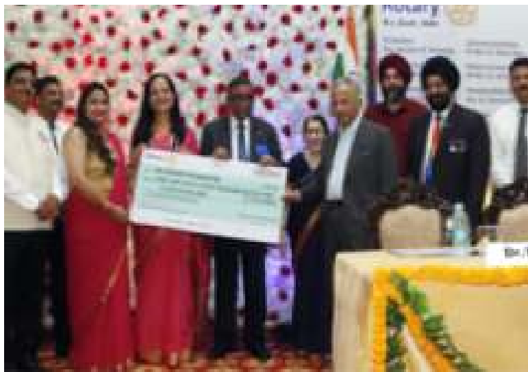
Honored two girls for achieving extra ordinary feats at a young age