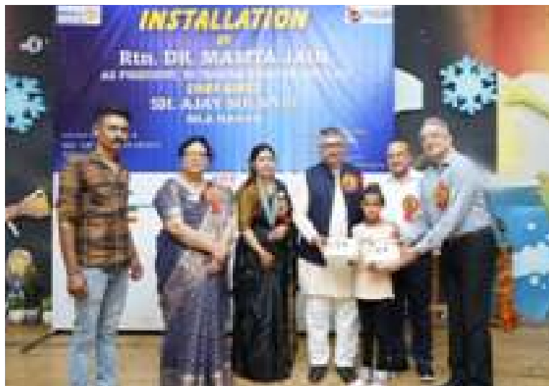
A hearing aid worth Rs 65000 was given to a girl born dumb and deaf.