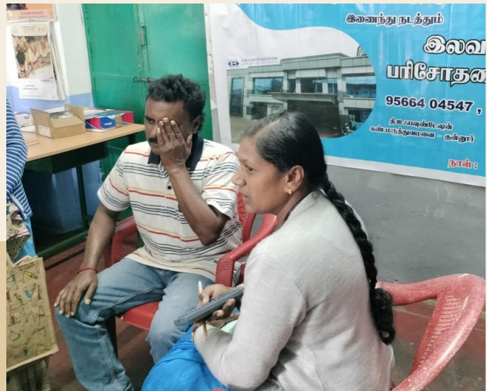
26/10 @ Kaithala