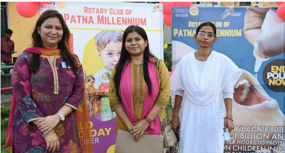
Rotary club of Patna millennium unveils clock tower as a symbol of community commitment