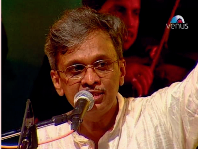
Mr. Shridhar Phadke Renowned Music Composer Marathi Film Industry