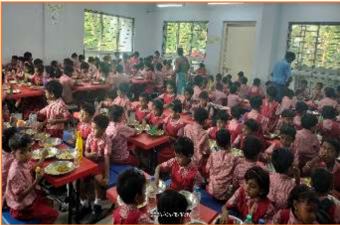
Children having sweets and celebrating New Year (Subho Nababorsho).