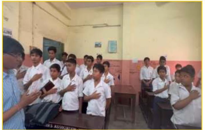
Four way test practice by students of South Calcutta School everyday.