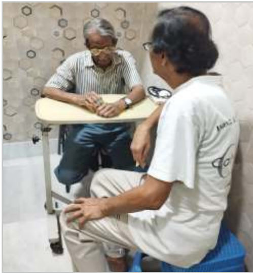
20 beneficiaries were treated in Homeopathy clinic in Bhawanipore.