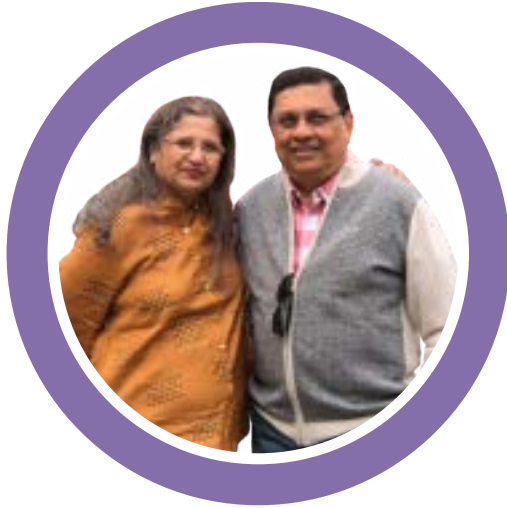
01 - KULIN & MINAXI