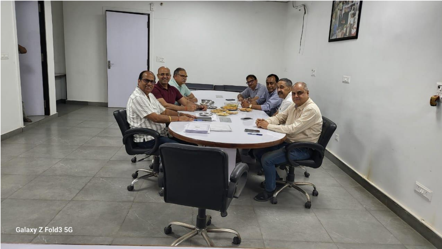
Galaxy Z Fold3 5G