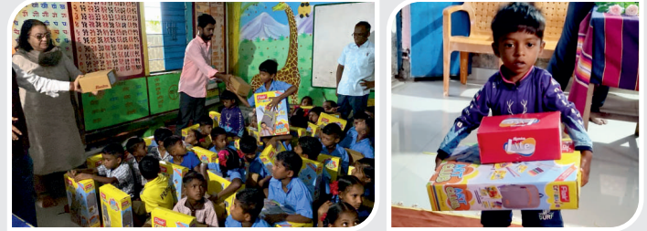
Distribution of School bags and Rainy sandals to students of Chembipada School