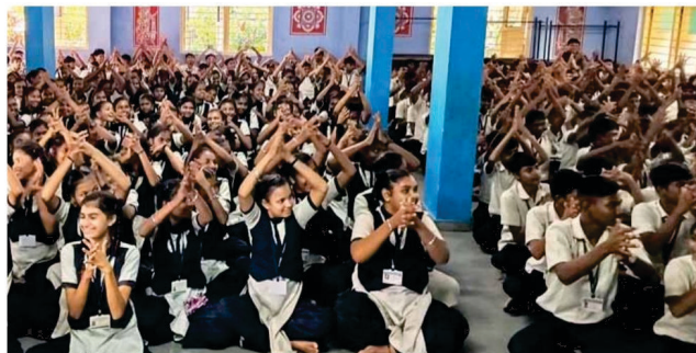
Students learn hand wash techniques.