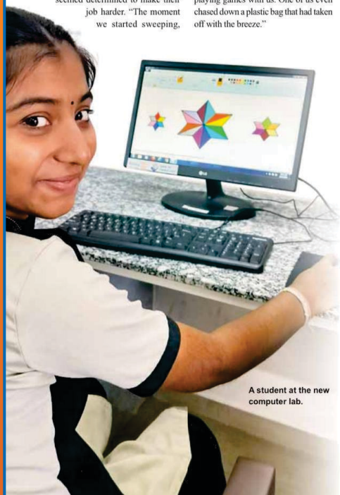
A student at the new computer lab.