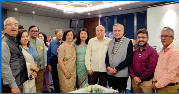
ROTARY CLUB OF SURAT WEST

Members of RC SURAT visited Installation Ceremonies of Neighboring Clubs