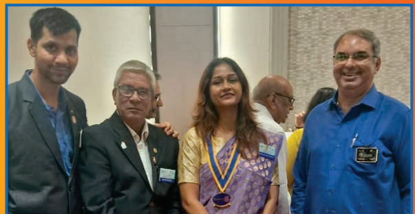
ROTARY CLUB OF RIVERSIDE