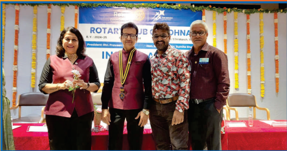
ROTARY CLUB OF UDHNA