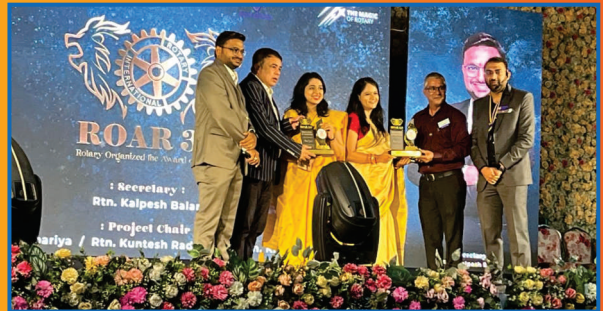
ROTARY CLUB OF SURAT EAST