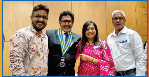
ROTARY CLUB OF ROUNDTOWN