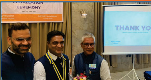
ROTARY CLUB OF SACHIN