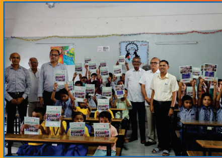
SRI VALAN PRABHA DIVISION EDUCATION MANDAL (WALAN) 1008 NOTEBOOKS DISTRIBUTED