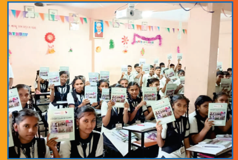
AMALSADI SCHOOL 1850 NOTEBOOKS DISTRIBUTED