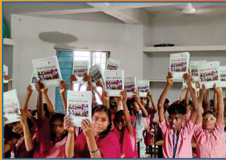
CHIKHLI PRIMARY SCHOOL 1152 NOTEBOOKS DISTRIBUTED

The Rotary Club of Surat has recently distributed notebooks to several schools, benefiting students in need. This effort aims to support their education by providing essential resources and ensuring that every student has the tools they need to succeed.