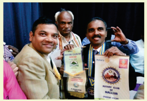
Flag Exchange with RC Nallur