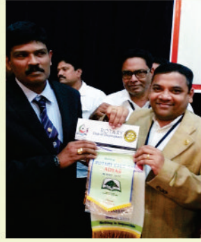
Flag Exchange with RC Chunnakam