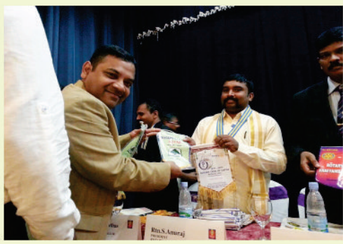
Flag Exchange with RC Jaffna