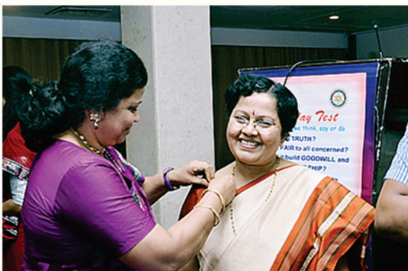
The District First lady pinned the Rotary badge