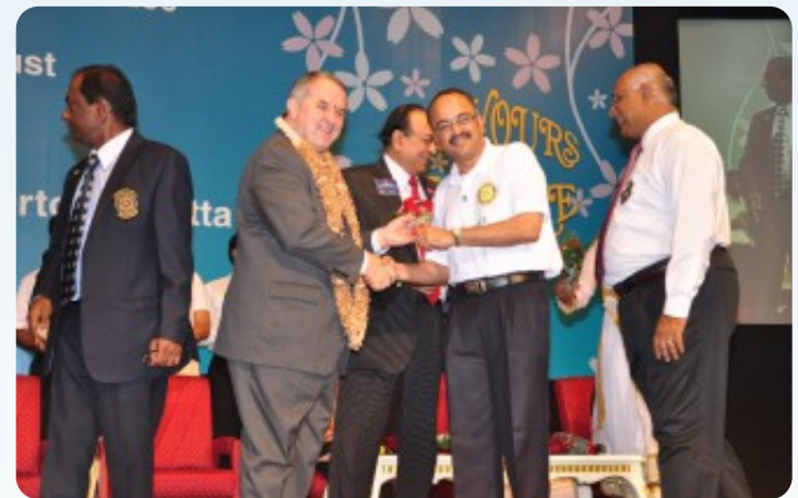
Recognition for the good work by the Club at Happy Village