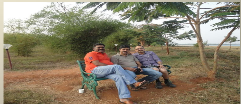
The three musketeers