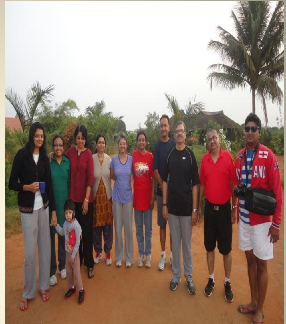
The morning walkers