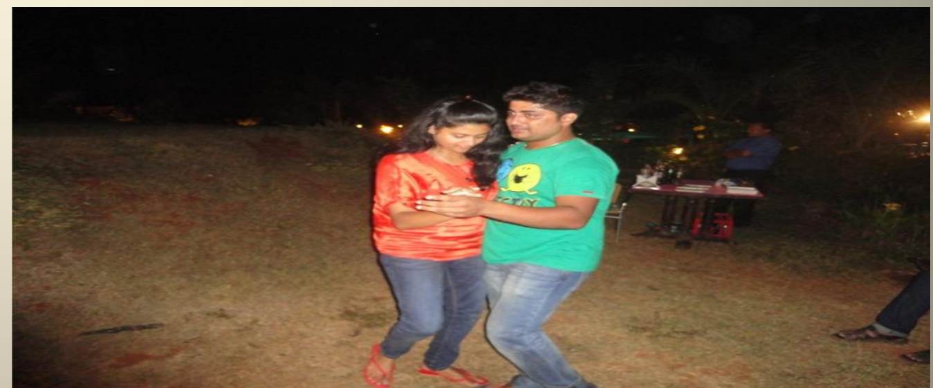
The dance masters at their own act