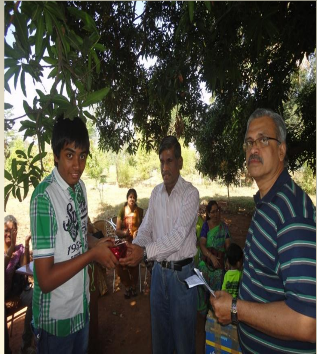
President giving away the prizes