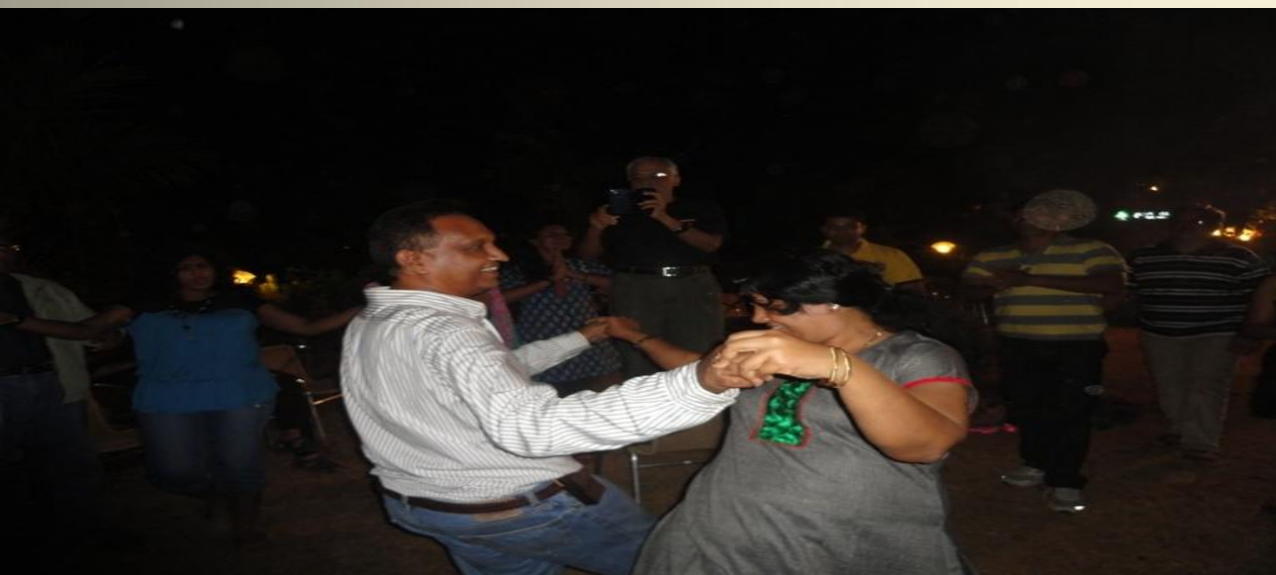
Well rehearsed steps