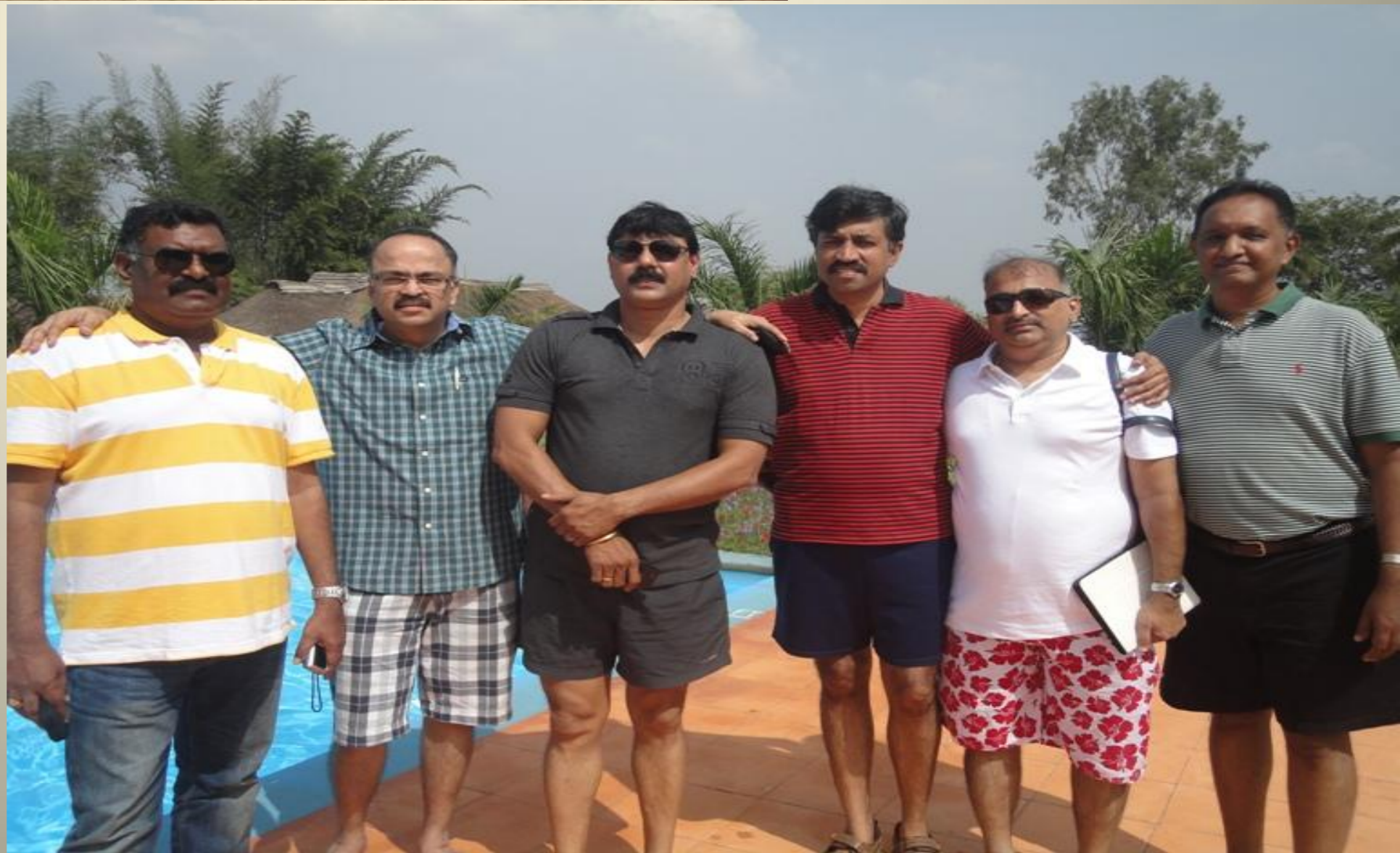
& THE BEASTS