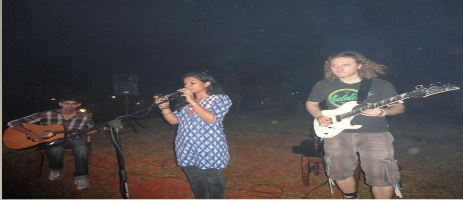
The Indian Singer with The German Guitarist