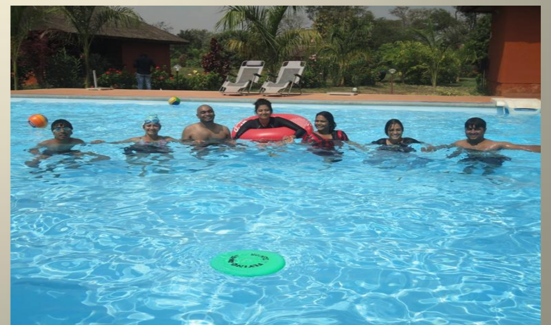
The Phelps of RCA