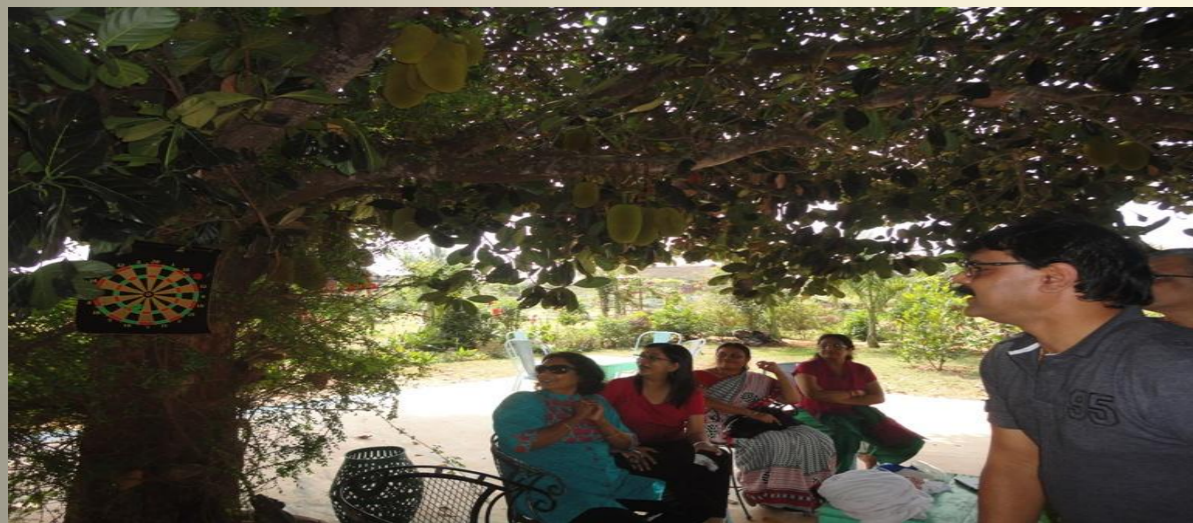
A game of DART