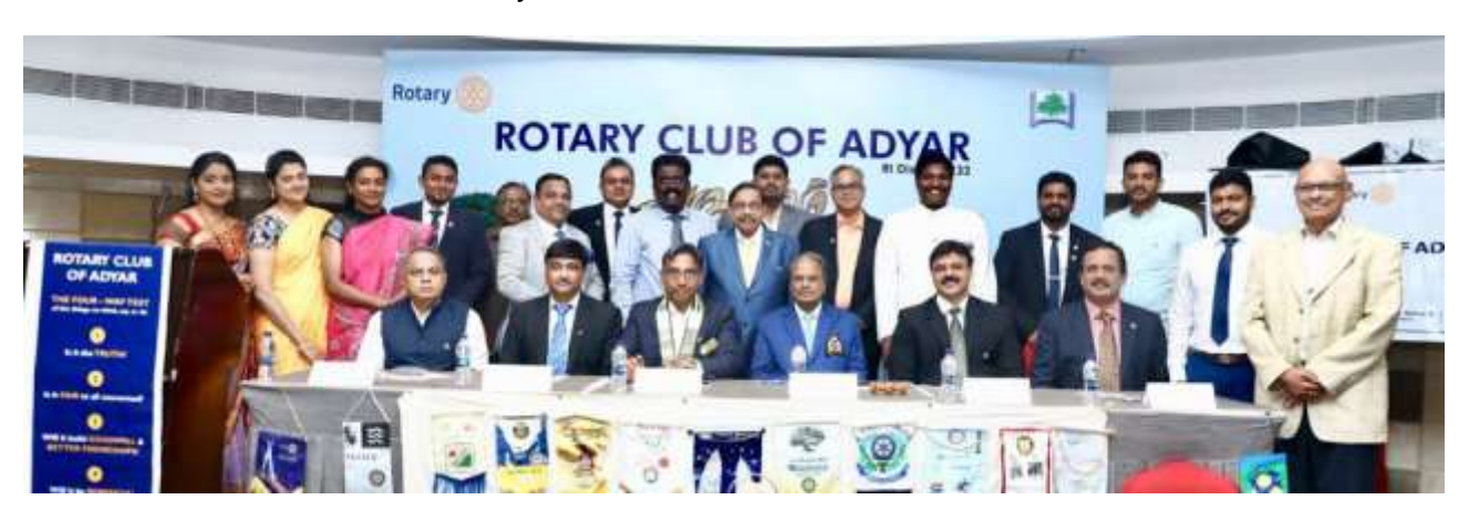
Installation of current year board