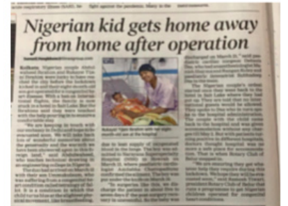
Times Of India