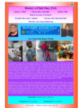
Rotary e-Club one,USA