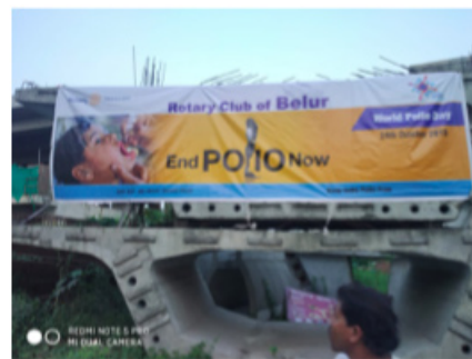
Polio Day Banner at many places